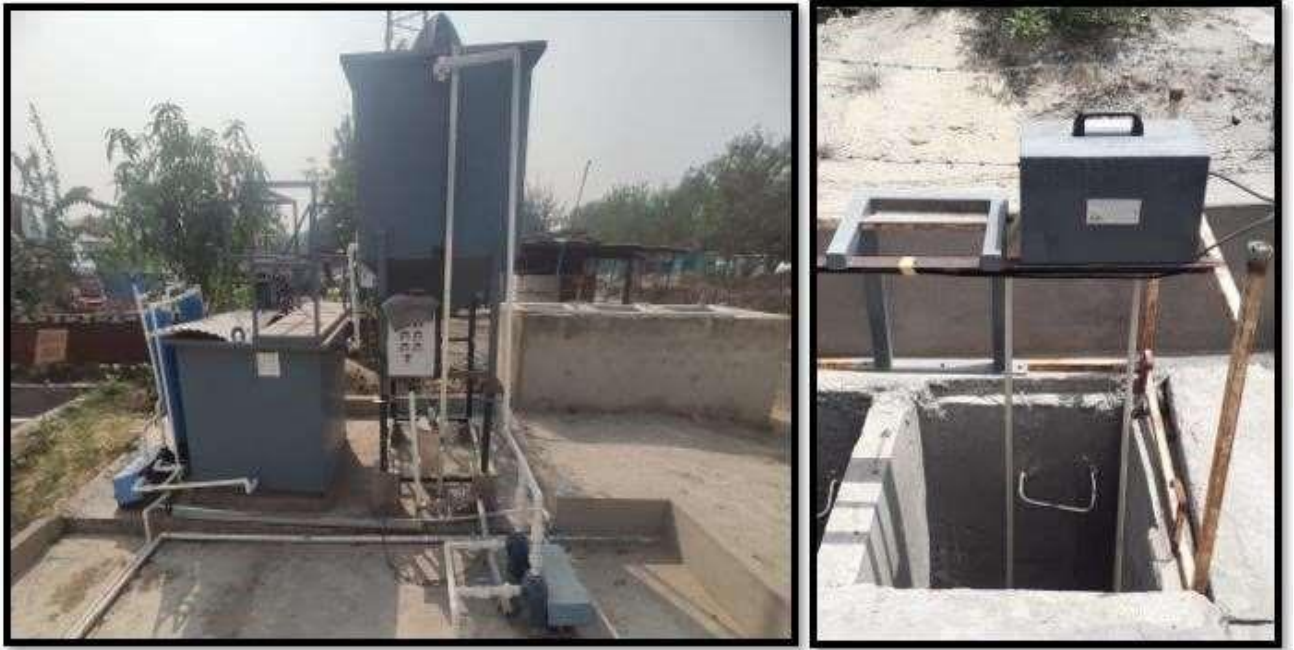
Fig 06- State of the art ETP in working condition with Oil Skimmer