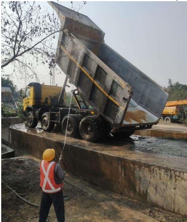
Fig 07 - Designated washing point, next to ETP