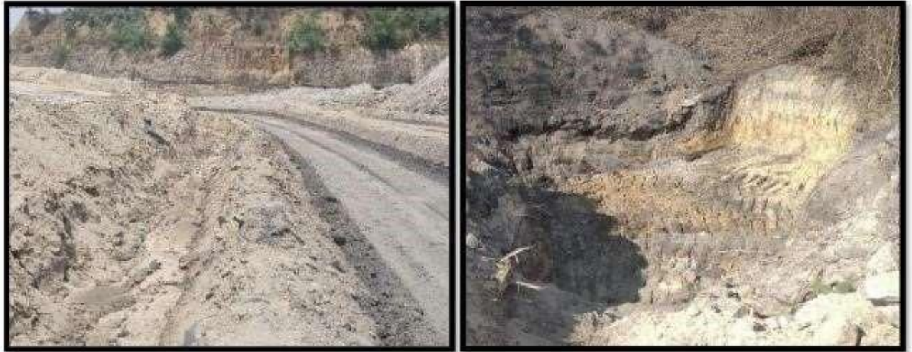
Fig 2- Garland Drain and Siltation Pond