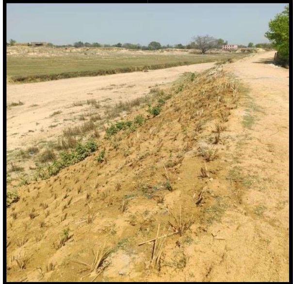
Fig 05- Plantation and grassing along the slopes of the Embankment