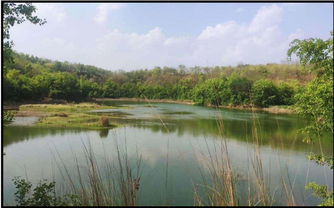
Fig 01 ij - Temporary water storage for Groundwater recharge and biodiversity conservation at Narayan Ahara