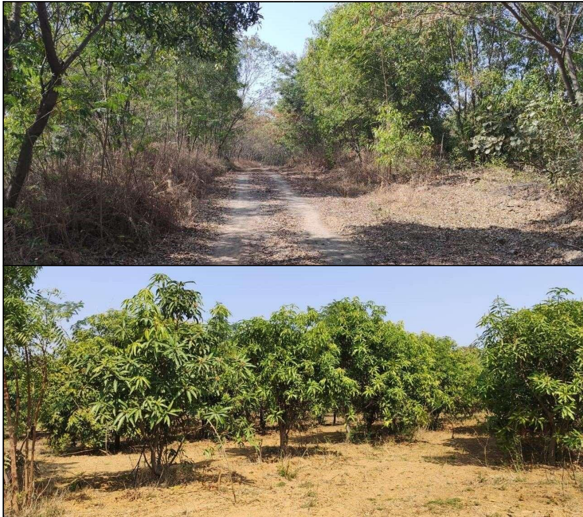
Fig.03- Self Sustaining Plantation on OB Dump