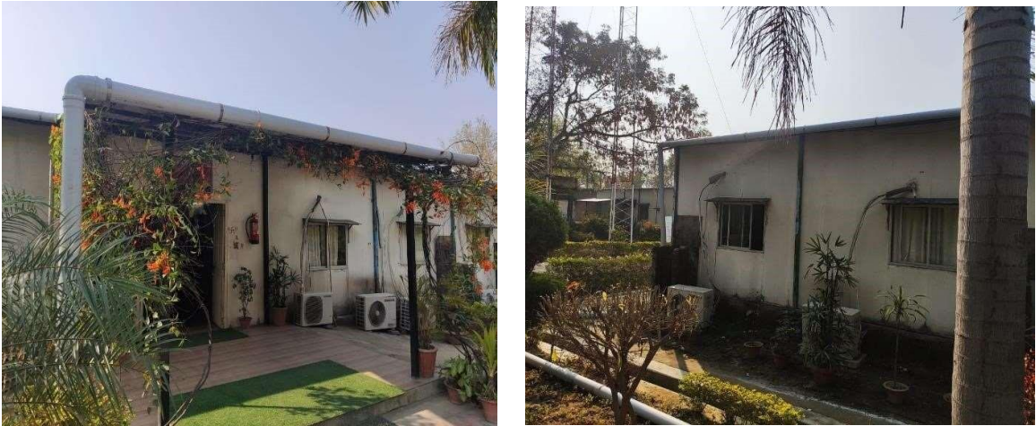
Fig 09 –Roof Top Direct Rainwater Harvesting Structure