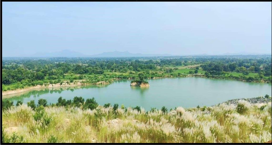
Fig 01 i - Temporary water storage at mined out Pit D