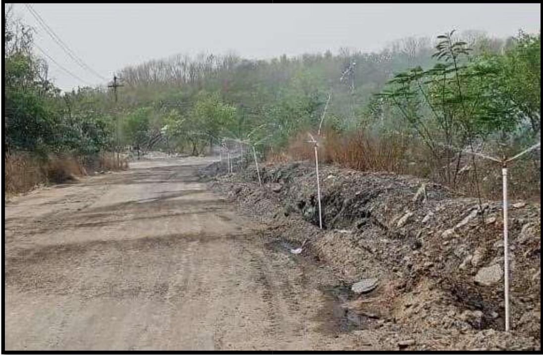
Fig 06- Fixed Type Water Sprinkler along Haul Road