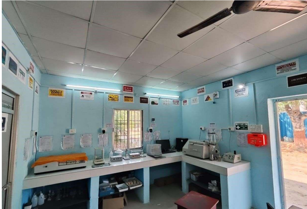
Fig 11 – Environmental Laboratory at KOCCM

From: Mainak Chakraborty < mainak.c@adityabirla.com > Sent: Friday, 4 March, 2022, 4:24 pm To: dfo-medininagar@gov.in < dfo-medininagar@gov.in > Cc: Sayantan Chakraborty < sayantan.chakraborty@adityabirla.com >; Raju Singh < raju.k.singh@adityabirla.com > Subject: Conservation Plan for Endangered species