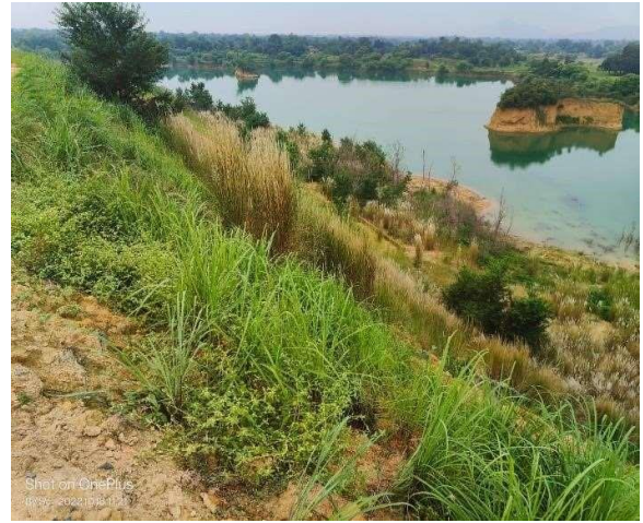
Fig 04- New Plantation on Top Soil Covered OB Dump and lemongrass plantation on the slopes