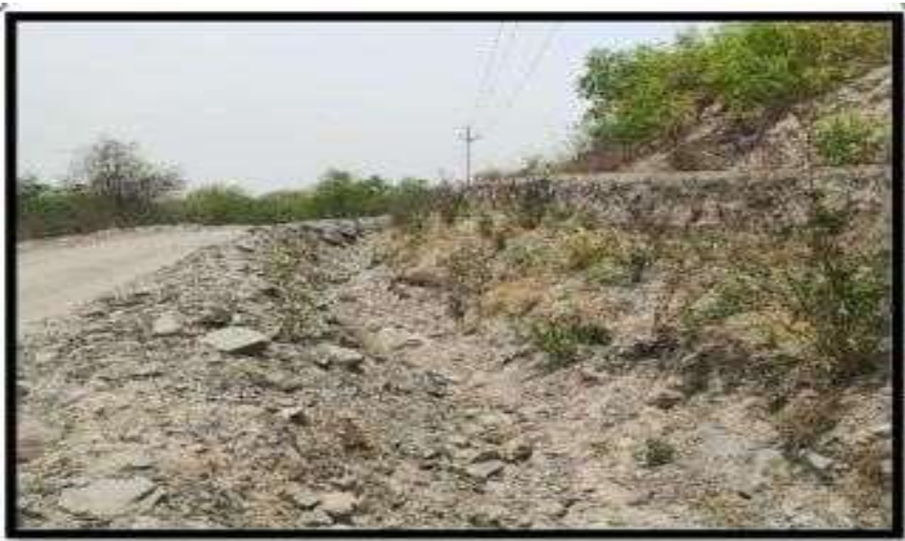
Fig 10 – Toe Wall along the Dump