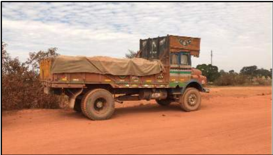
(Photographs of covered truck)