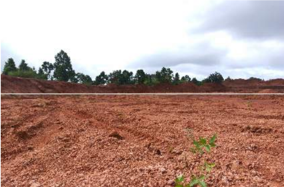
(Photographs of Reclaimed areas)