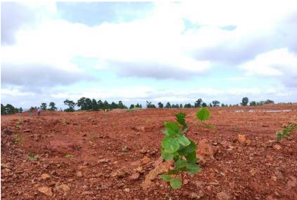
(Photographs of plantation)