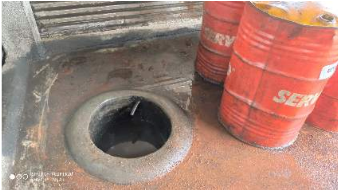
Photographs of Oil and Grease Trap