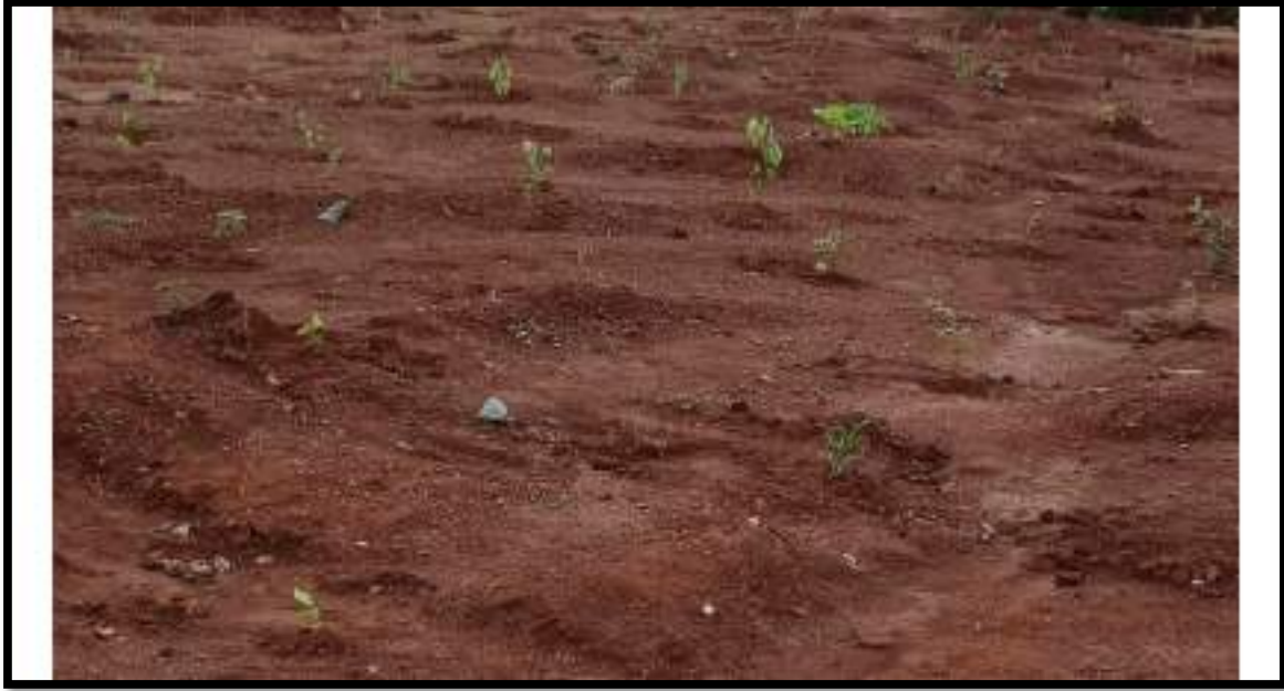
(Plantation over reclaimed area)