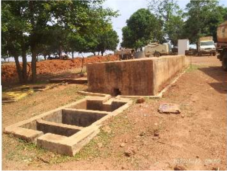
(Washing Ramp and Oil and grease trap)