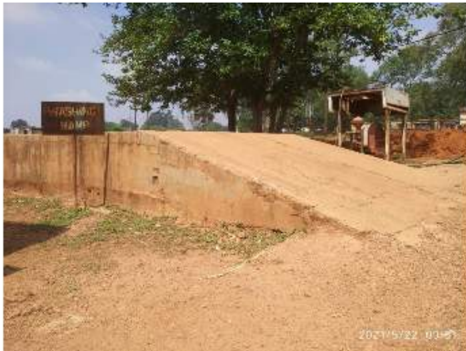
(Washing platform and oil & grease trap)