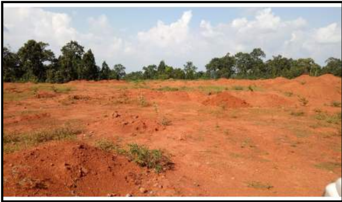
(Plantation over reclaimed area)