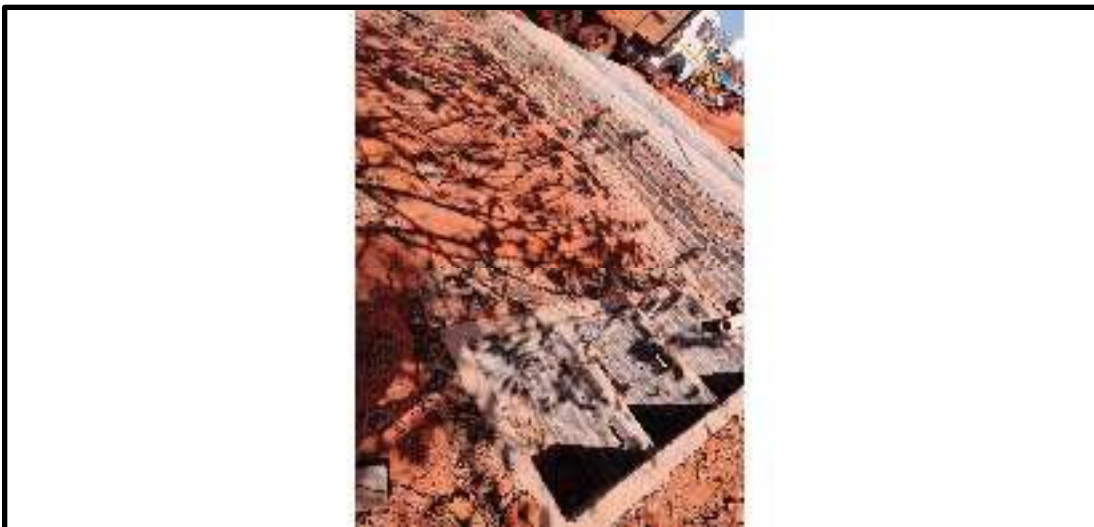
(Washing Ramp and oil-grease trap)