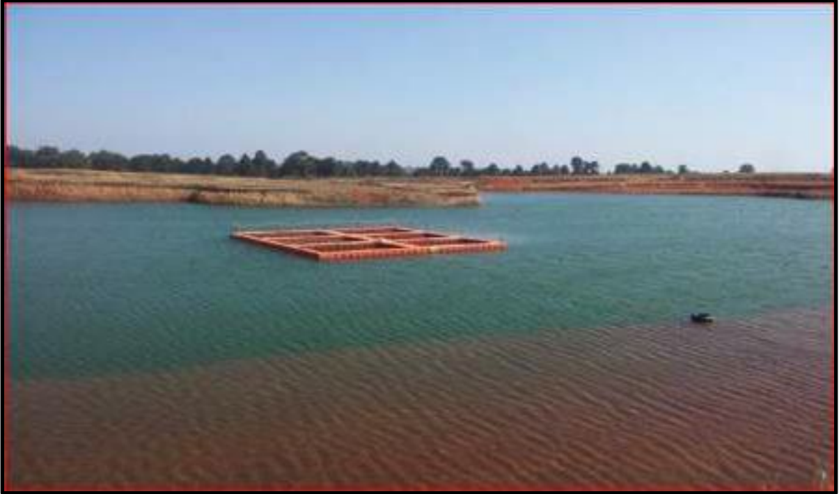
(Rainwater harvesting pond)