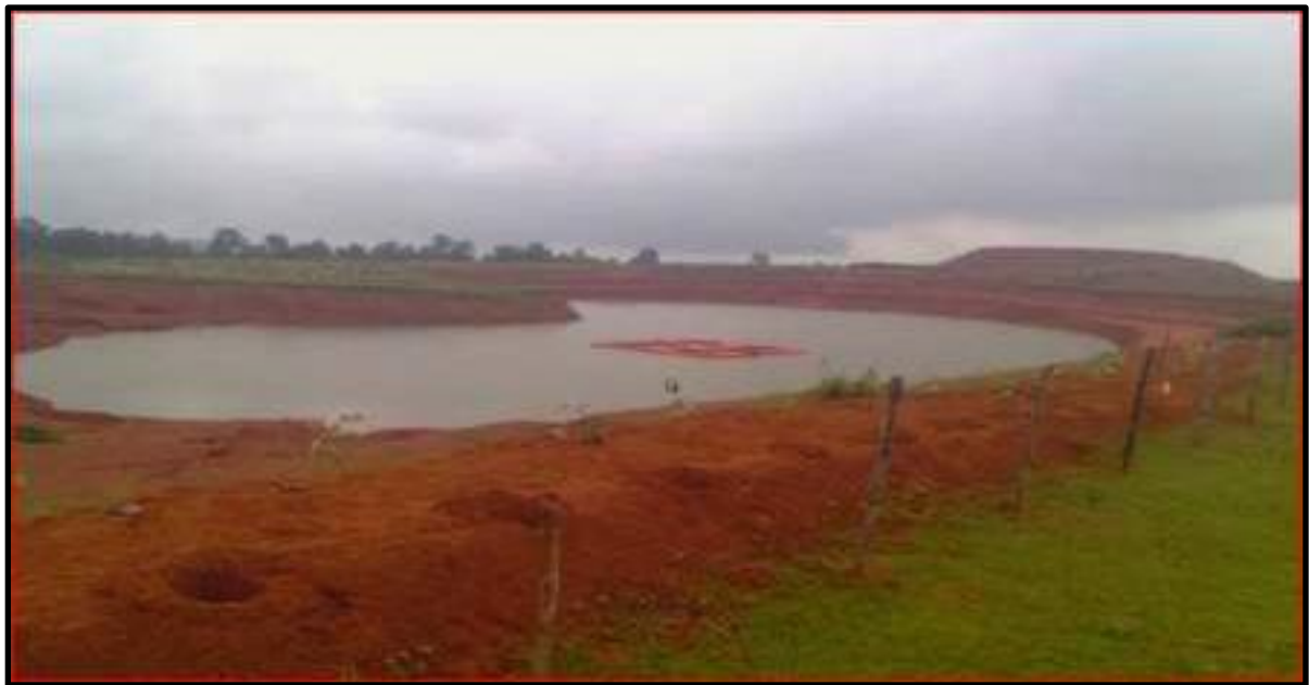
(Rainwater harvesting pond)