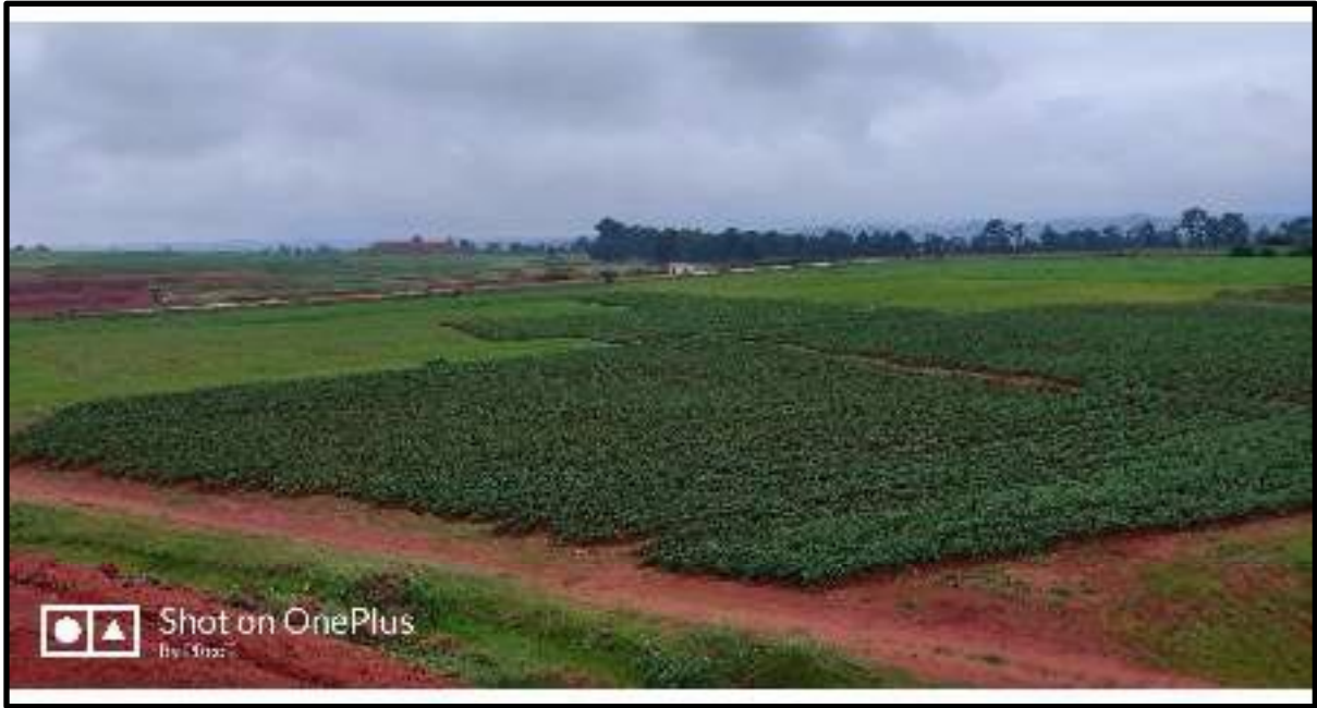
(Potato Cultivation in Reclaimed areas)