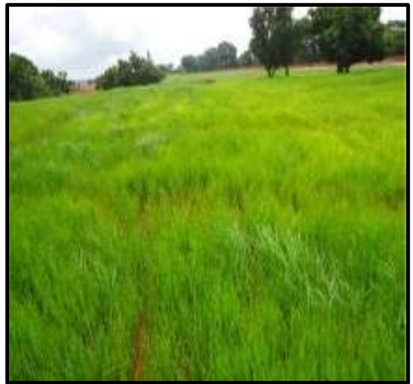
(Potato and paddy Cultivation in Reclaimed areas)