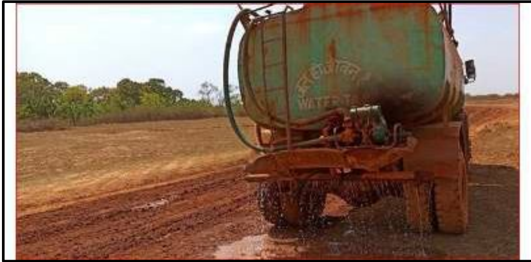
(Water sprinkling at mine)