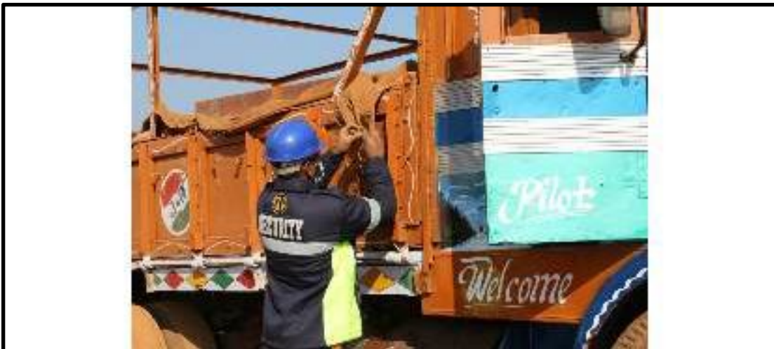
(Tarpaulin covered Truck)