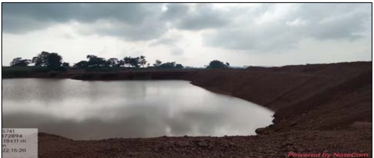
Rainwater Harvesting Pond