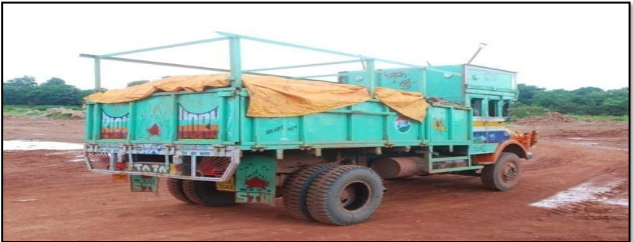
Tarpaulin covered truck