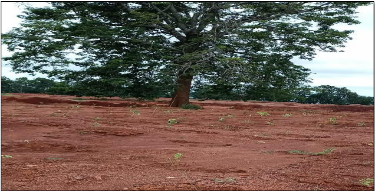
Plantation over reclaimed area