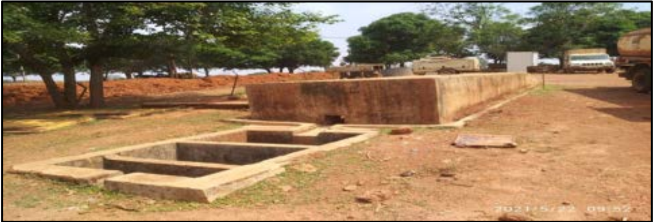
Washing Ramp and Oil and grease trap