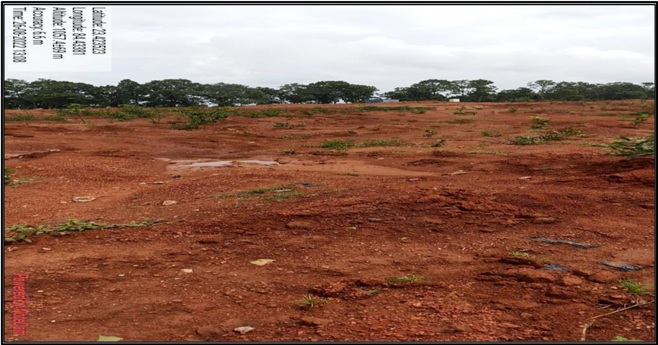
Plantation over reclaimed area