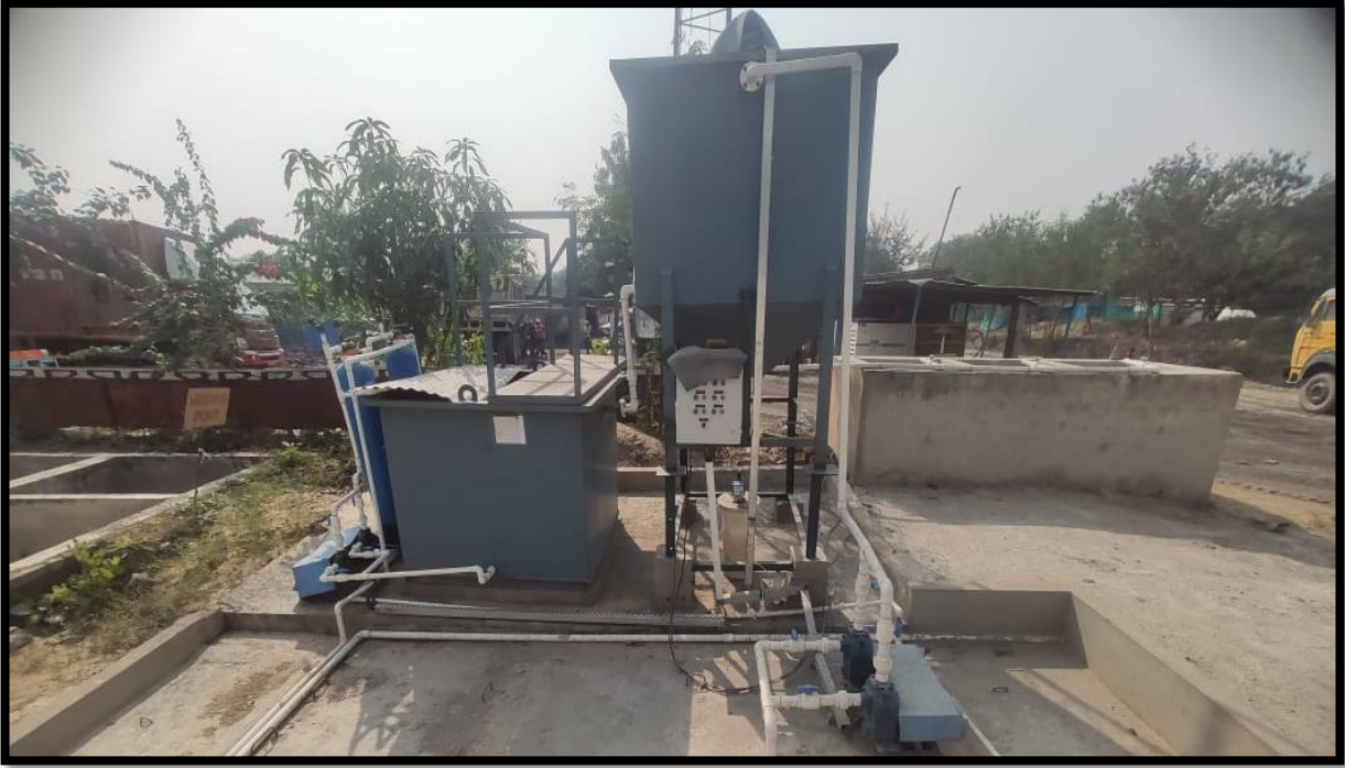
Fig 06- State of the art ETP