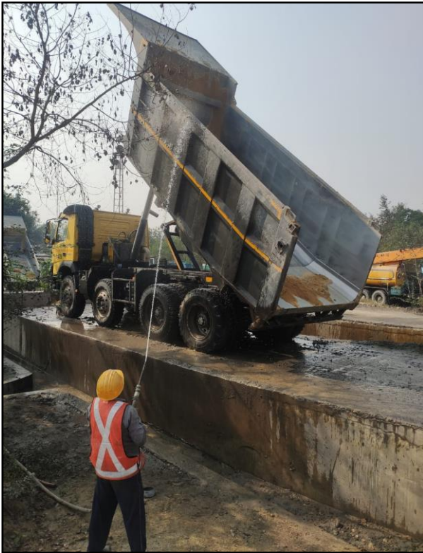
Fig 07 - Designated washing point, next to ETP