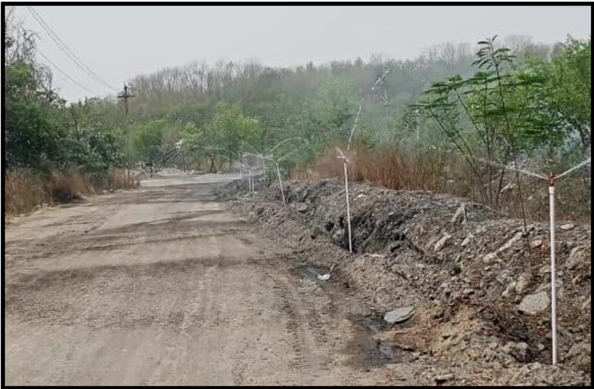
Fig 05- Fixed Type Water Sprinkler along Haul Road