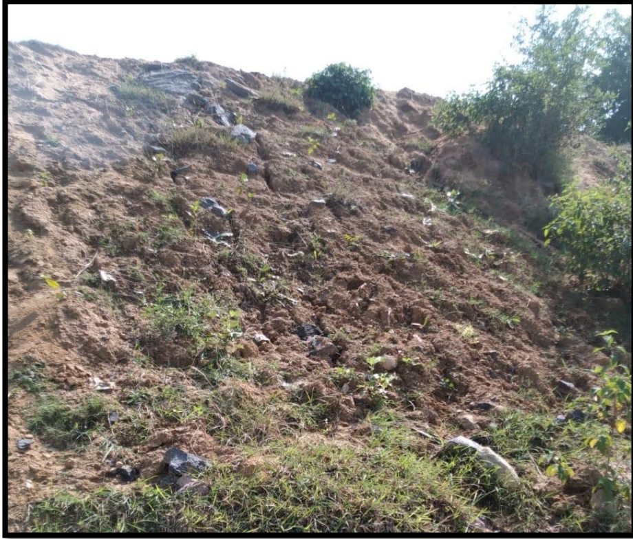
Fig 04- Plantation along the slopes of Embankment