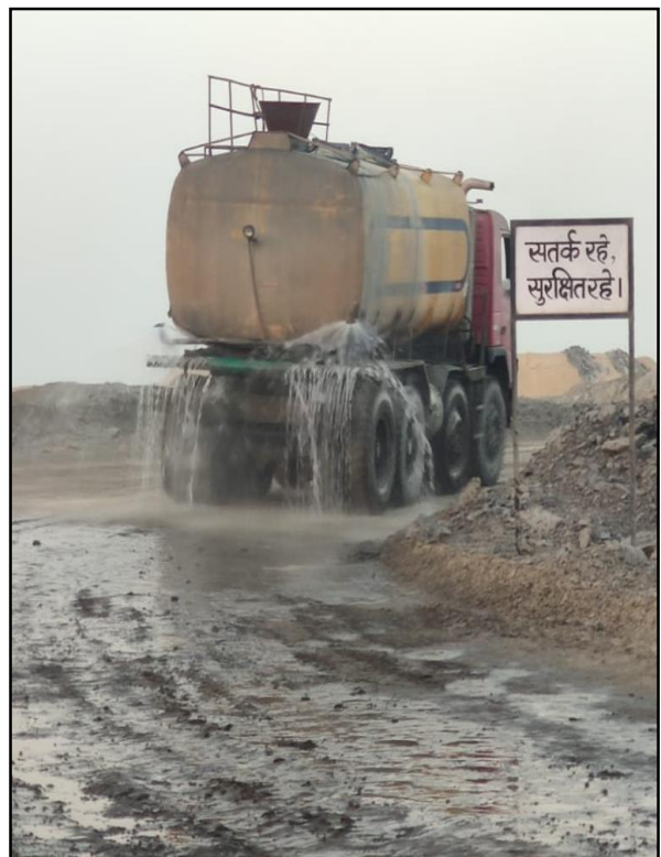
Fig 08- Mobile Water Sprinkling by trucks