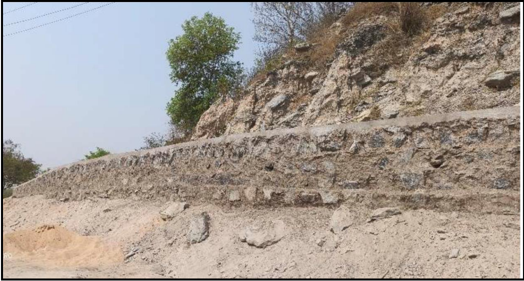
Fig 09 – Newly constructed Toe Wall along base of the Dump