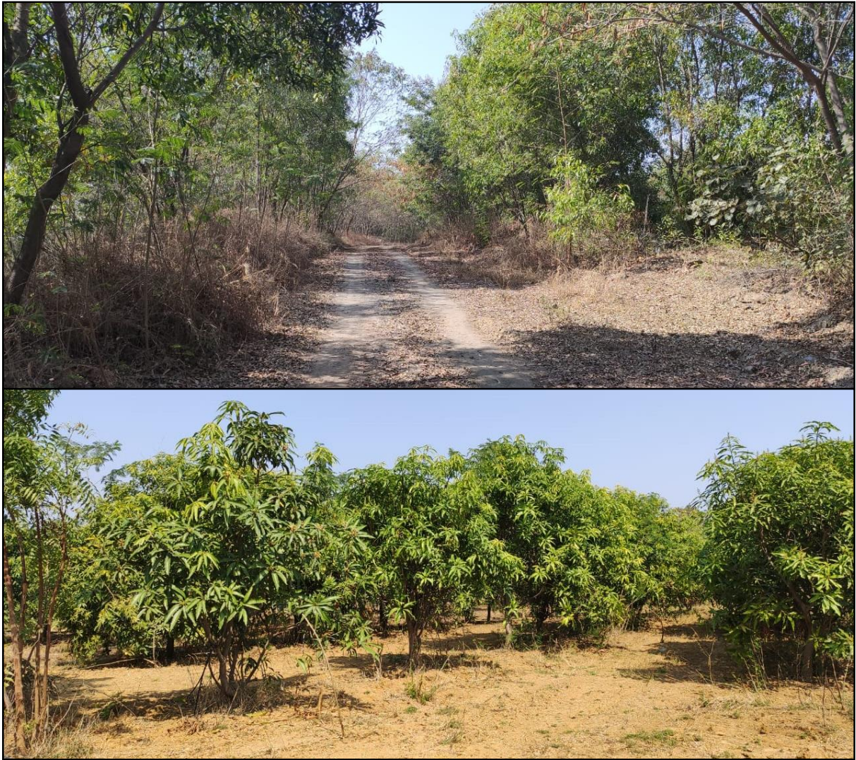
Fig 02- Self Sustaining Plantation on OB Dump