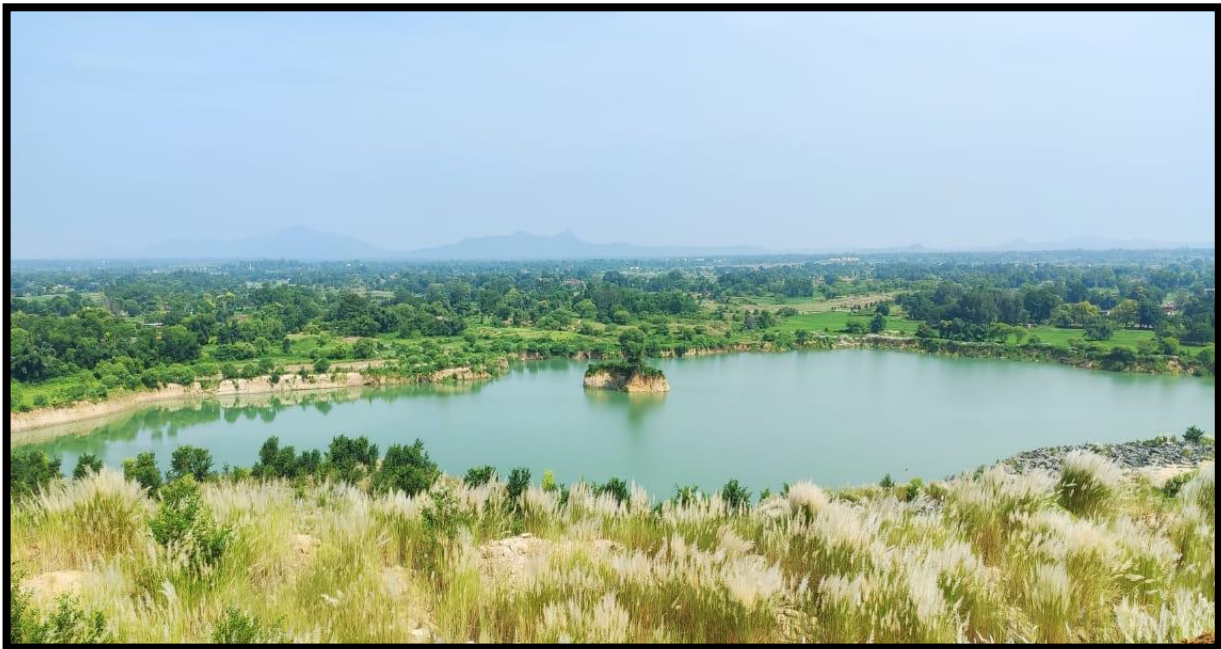
Fig 01- Temporary water storage at mined out Pit D