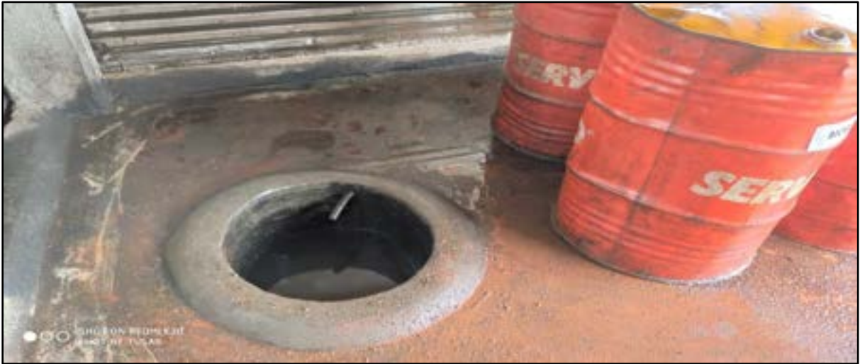
Photographs of Oil and Grease Trap