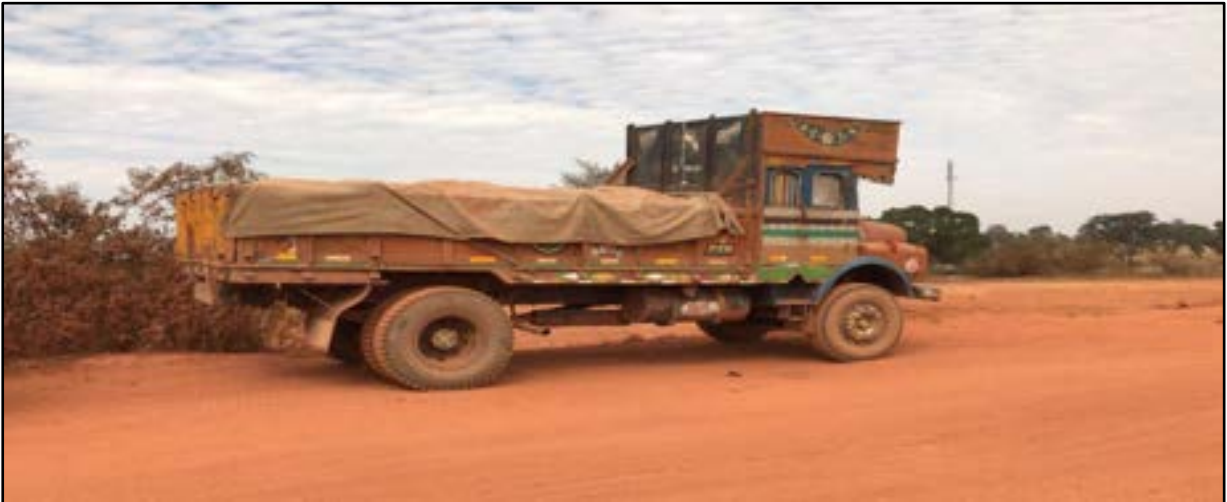
Photographs of covered truck