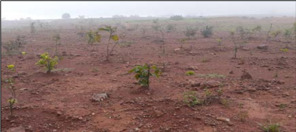
Plantation at Reclaimed area