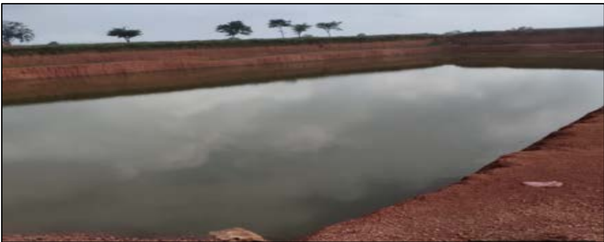
Rainwater Harvesting Pond