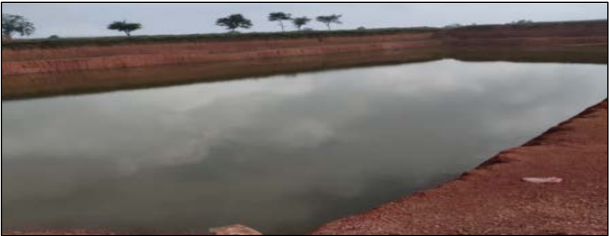
Rainwater Harvesting Pond