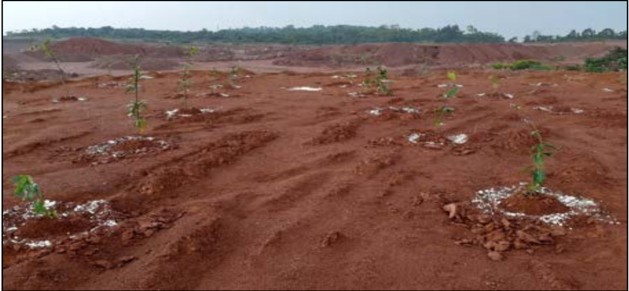
Reclaimed area plantation FY22-23