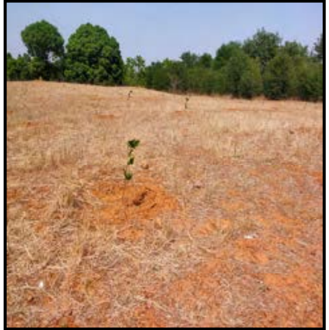
PLANTATION OF LAST YAER