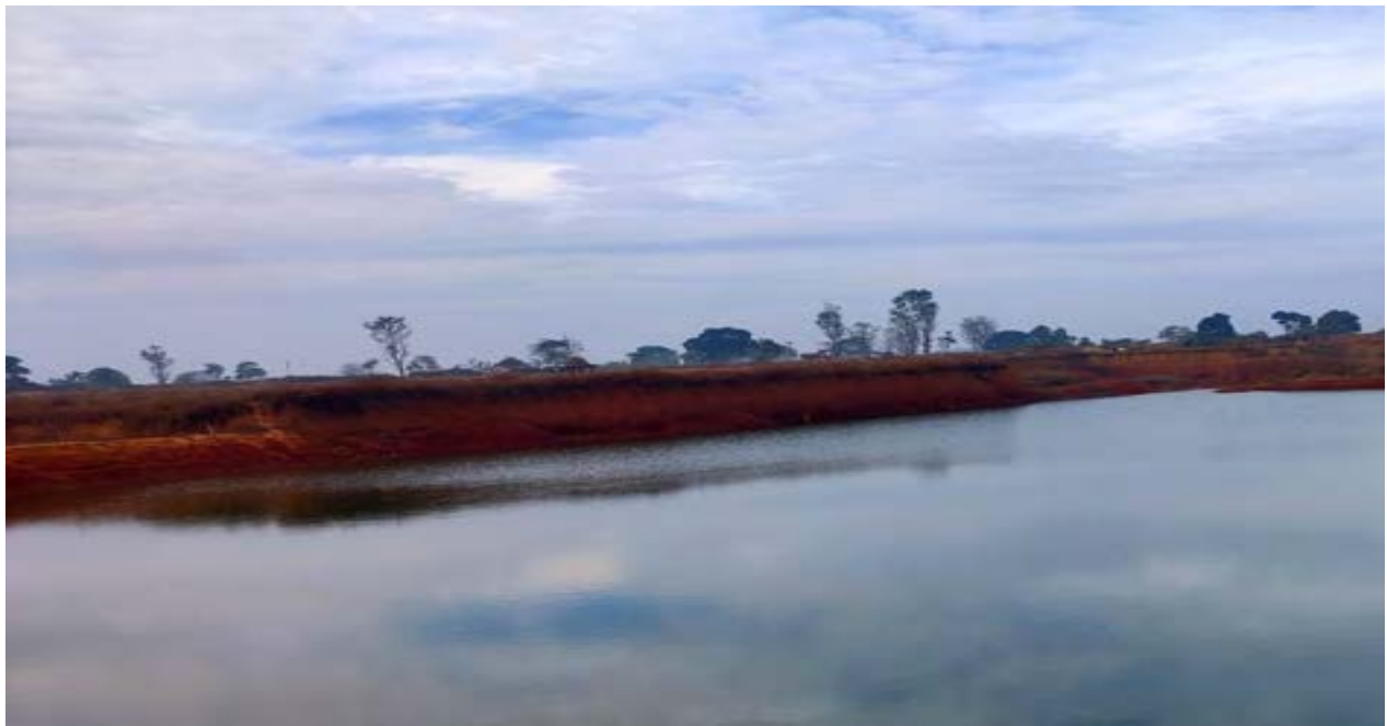
RAINWATER HARVESTING POND