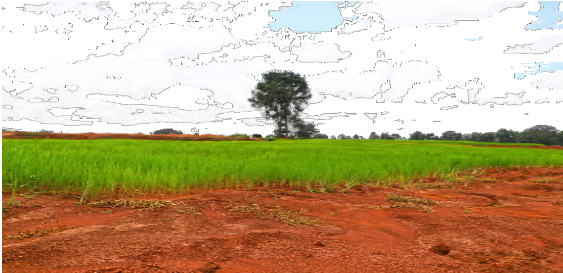
PADDY CULTIVATION ON RECLAIMED LAND