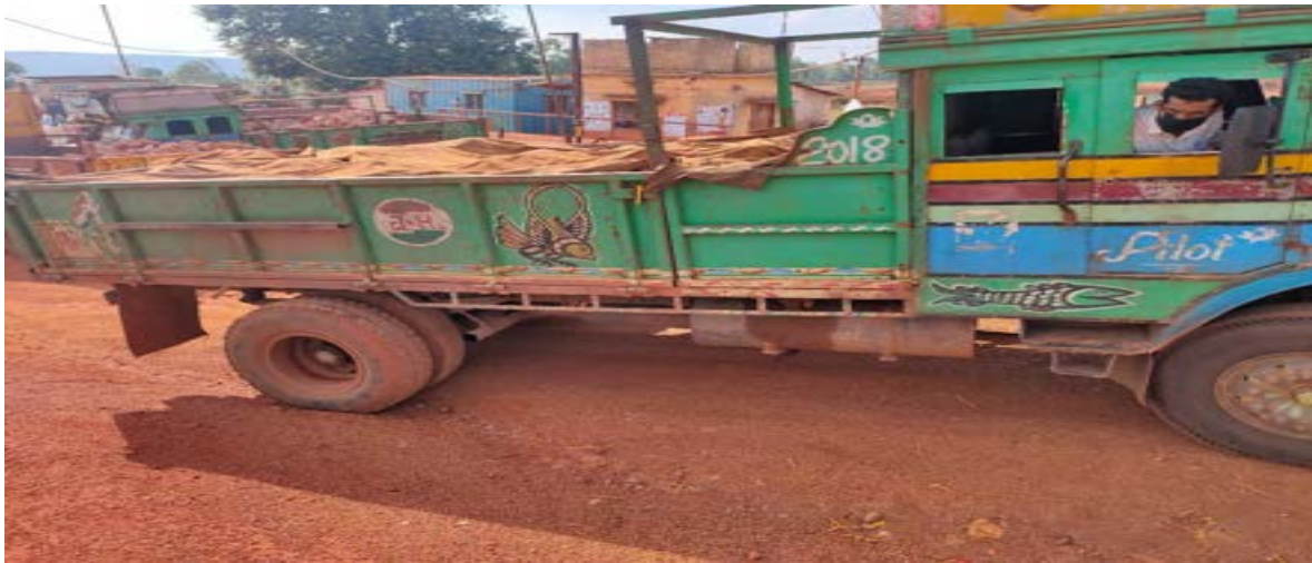
TARPULIN COVER OF BAUXITE TRUCKS