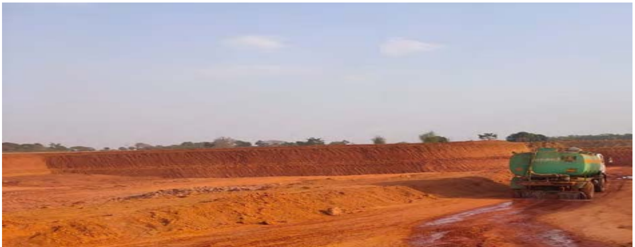
WATER SPRINKLING ON HAUL ROAD