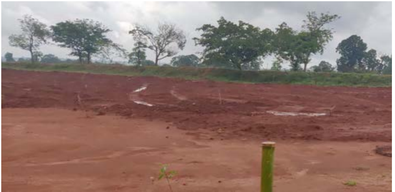
PLANTATION AT RECLAIMED AREA