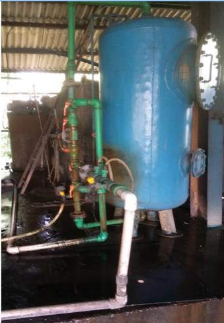
Iron Removal Plant (IRP Plant) – Milupara – 5 Cum / Hrs