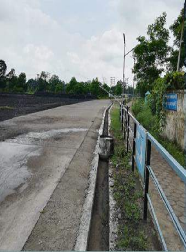
Fixed type of water sprinklers GP IV/5 coal mine