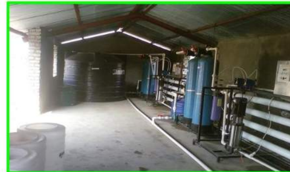
Reverse Osmosis Plant (RO Plant) – Kondkel 2 x 2 Cum/Hrs