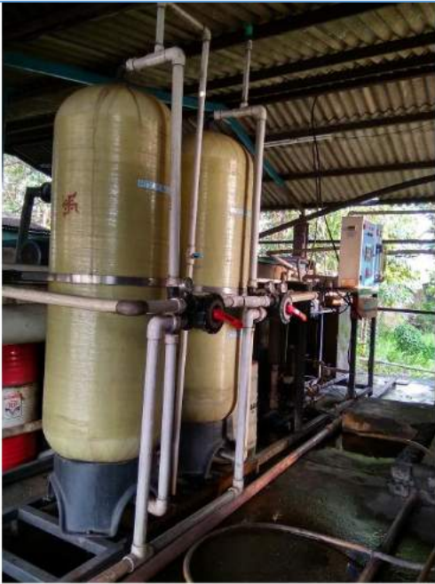
Reverse Osmosis Plant (RO Plant) – Milupara – 5 Cum / Hrs