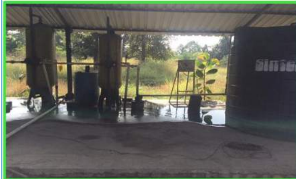
Water Treatment Plant (WTP) – Kondkel – 5 X 5 Cum / Hrs