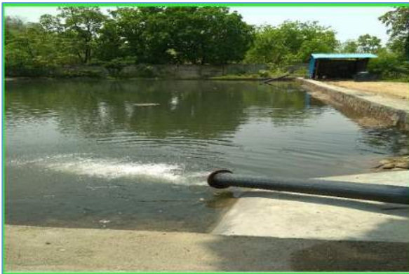
SETTLING POND NO – 5