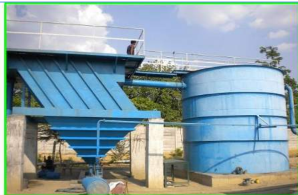
Effluent Treatment Plant - Kondkel – 200 Cum /Hrs X 2