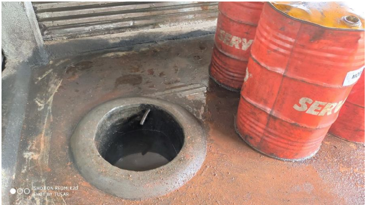
Photographs of Oil and Grease Trap