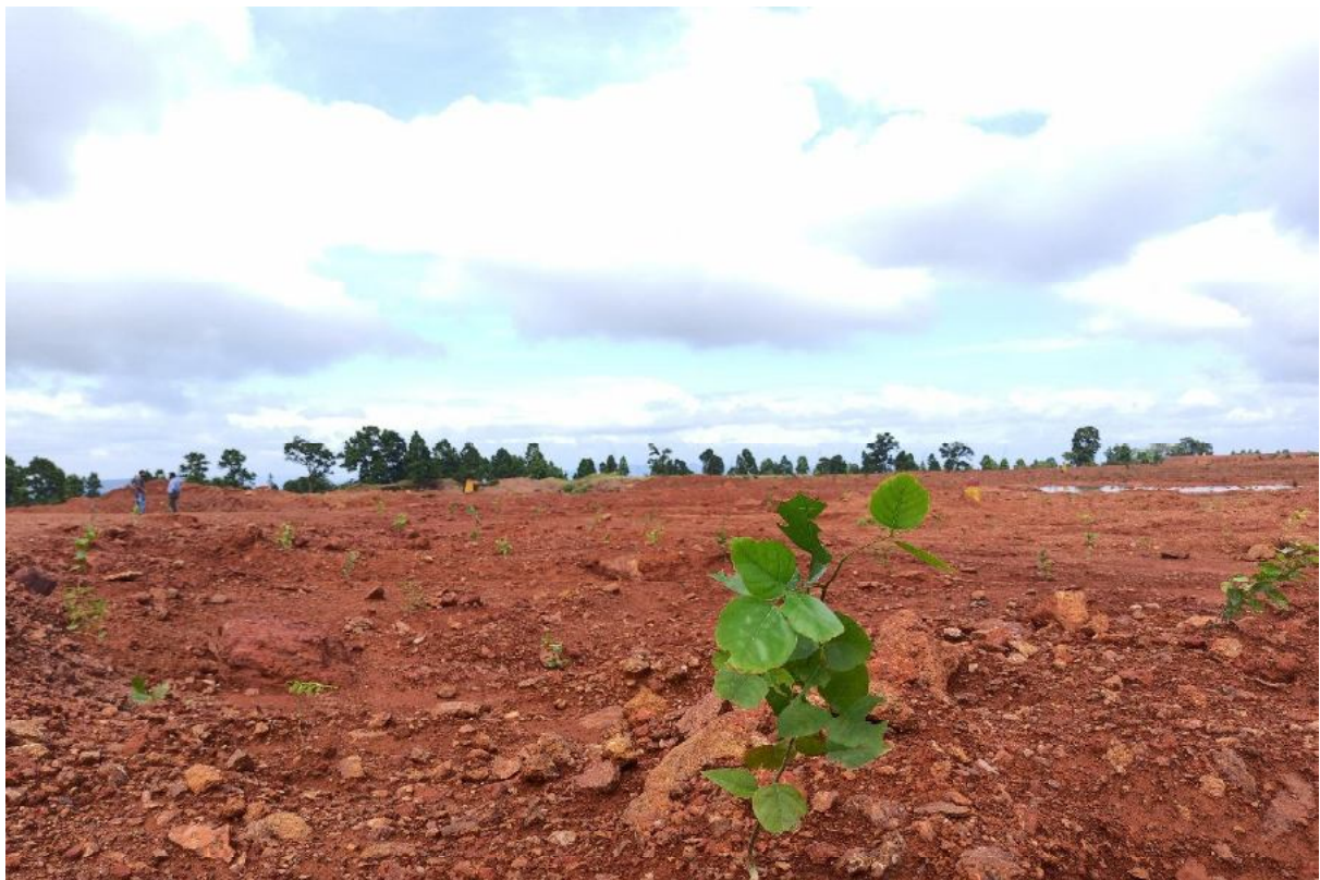
(Photographs of plantation)