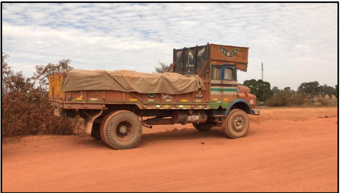
(Photographs of covered truck)