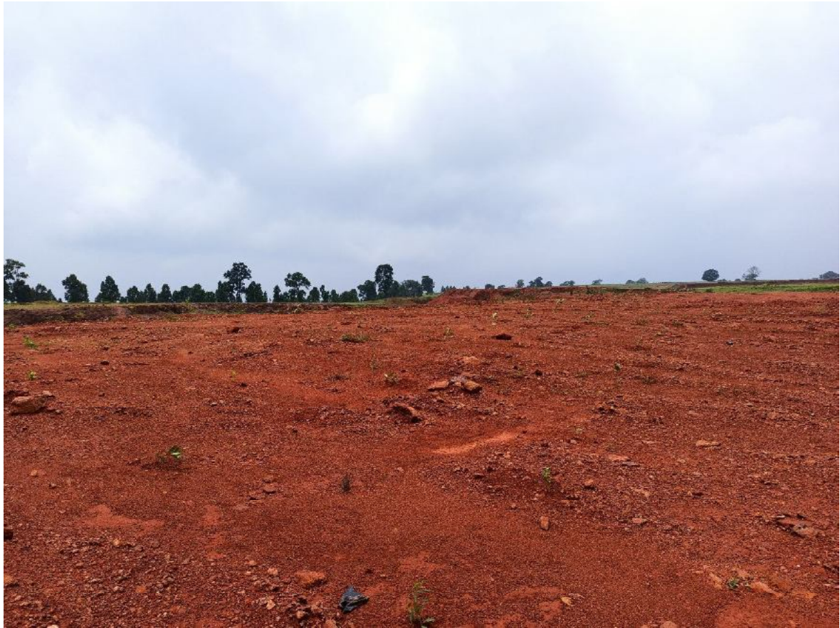
(Photographs of Reclaimed areas)