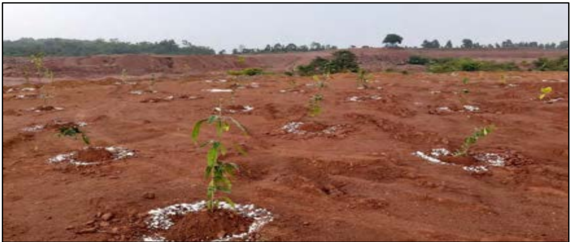
Plantation at Reclaimed area