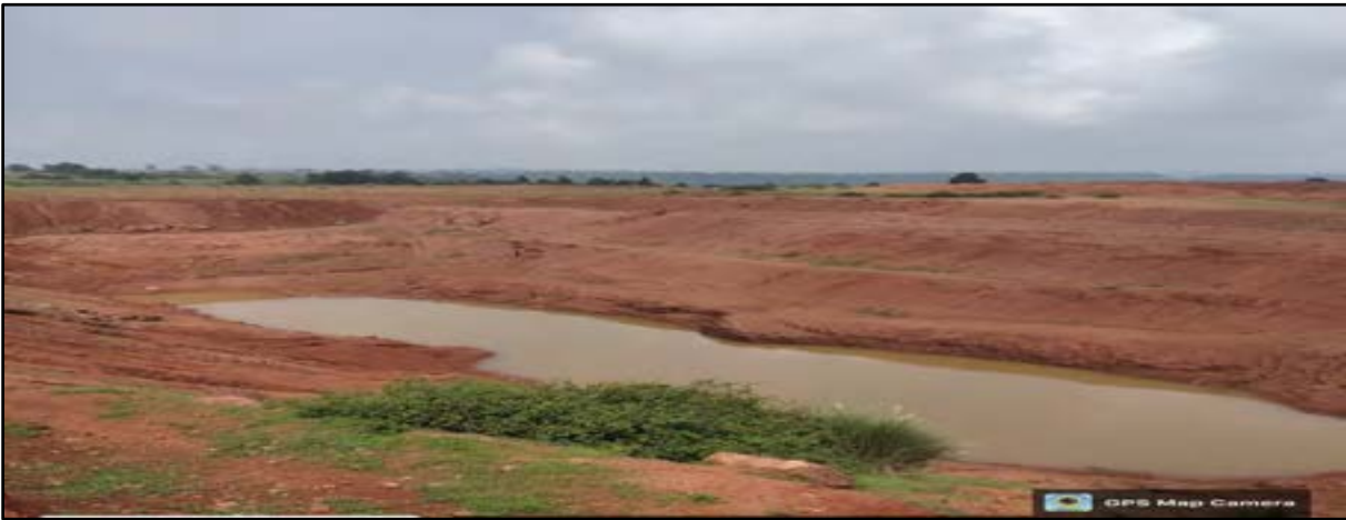
Rainwater Harvesting Pond