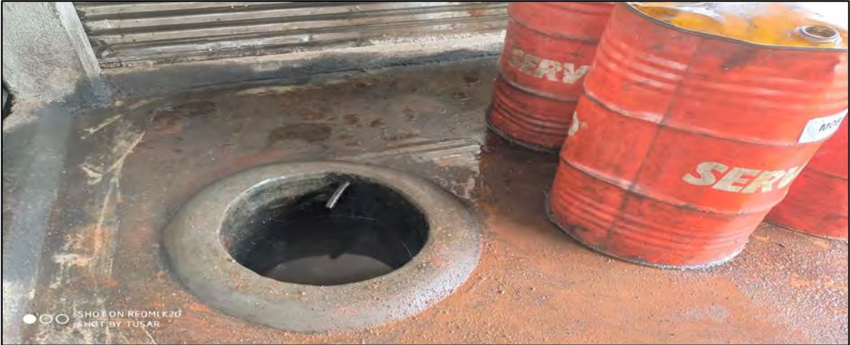
Photographs of Oil and Grease Trap