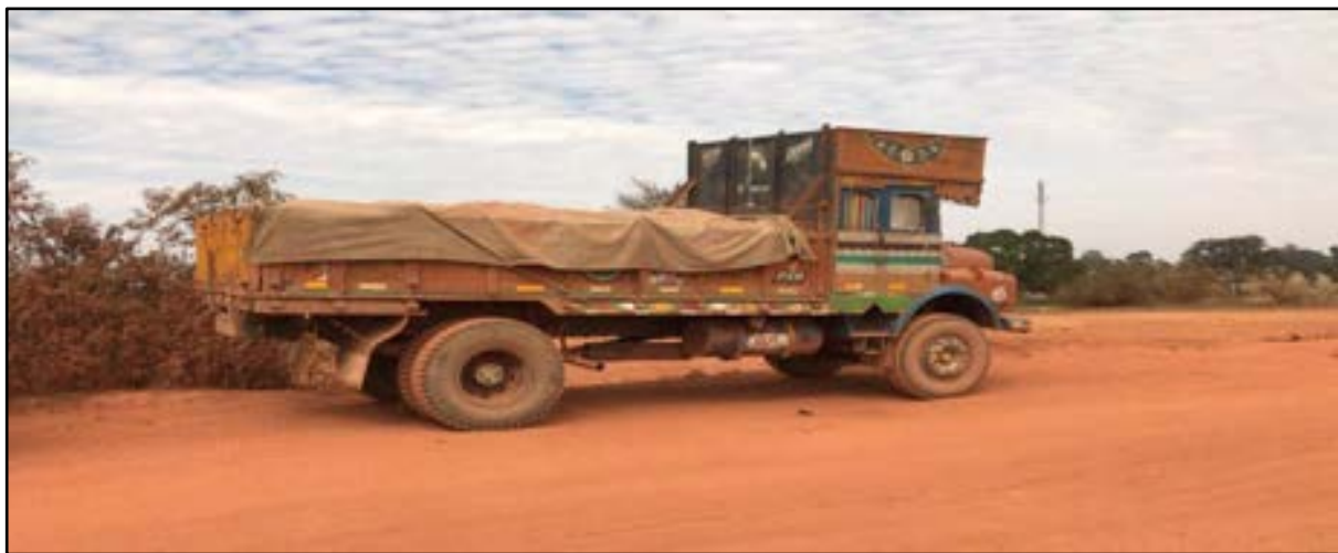
Photographs of covered truck