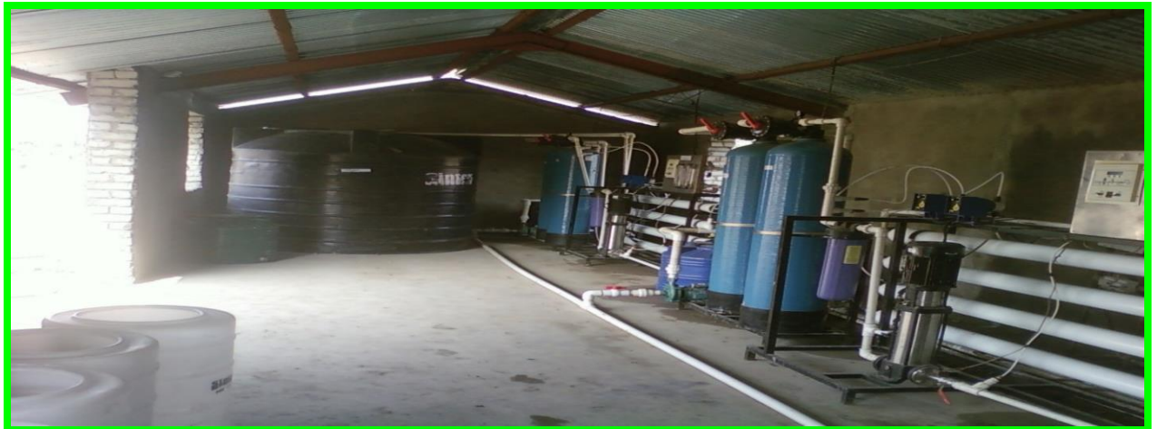
Reverse Osmosis Plant (RO) - 2 x 2 CuM per Hours