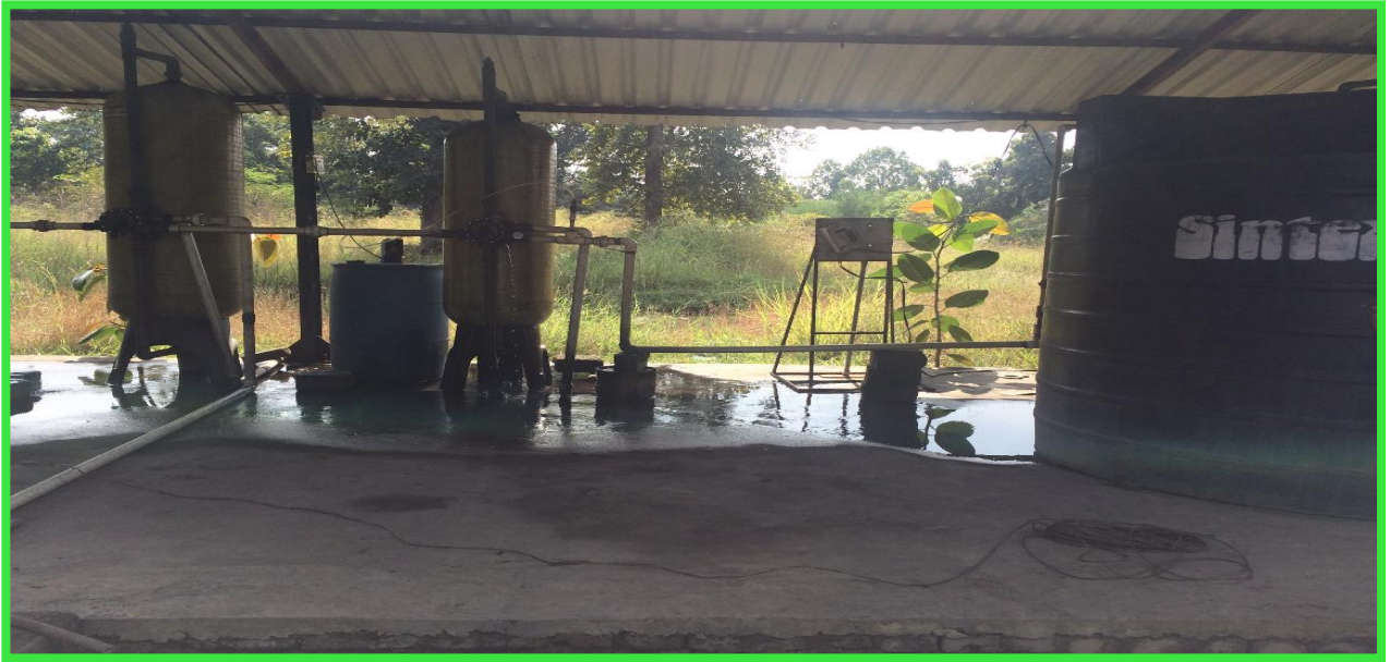
Water Treatment Plant (WTP) - 5 x 5 CuM per Hours