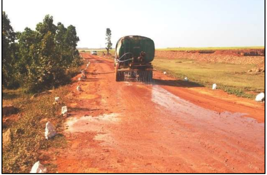
Water Sprinkling in the Haul Road

Reply to Condition 12: Regular water spraying with 12 KL water tanker in the mine lease hold area is being carried out regularly to control air pollution. The ambient air quality is within the stipulated norms.