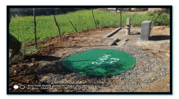
RWH Pond & Recharge well

Condition-12: Regular water sprinkling shall be carried in critical areas prone to air pollution and having high levels of SPM and RSPM such as haul road, loading, unloading and transfer points and other vulnerable areas. It should be ensured that the ambient air quality parameters conform to the norms prescribed by the CPCB in this regard.