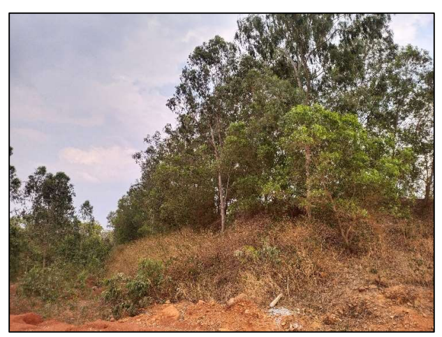
Old Inactive OB Dump with Plantation

Condition-7: Garland drains shall be constructed to arrest silt and sediment flows from soil and mineral dump. The water so collected shall be utilized for watering the mine area, roads, greens belt development etc. The drains shall be regularly desilted particularly after monsoon and maintained properly. Garland drain (size, gradient and length) shall be constructed for both mine pit and for waste dump and sump capacity shall be designed keeping 50% safety margin over and above peak sudden rainfall (based on 50 years data) and maximum discharge in the area adjoining the mine site. Sump capacity shall also provide adequate retention period to allow proper settling of silt material. Sedimentation pits shall be constructed at the corners of the garlands drains and desilted at regular intervals.