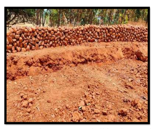
Condition-8: The project proponent shall ensure that no natural water course shall be obstructed due to mining operation.

Reply to Condition 8: We undertake that no natural water course is obstructed during mining operation.