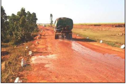
Water Sprinkling in the Haul Road

Reply to Condition 12: Regular water spraying with 12 KL water tanker in the mine lease hold area is being carried out regularly to control air pollution. The ambient air quality is within the stipulated norms.