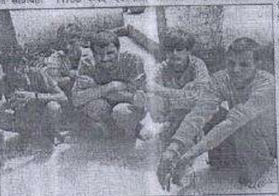
पेसे खोग भी चीलते हैं जुआ