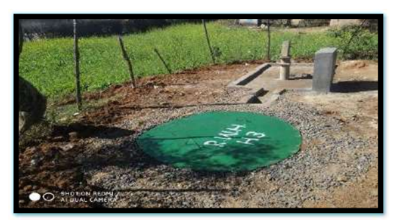
RWH Pond & Recharge well

Condition-12: Regular water sprinkling shall be carried in critical areas prone to air pollution and having high levels of SPM and RSPM such as haul road, loading, unloading and transfer points and other vulnerable areas. It should be ensured that the ambient air quality parameters conform to the norms prescribed by the CPCB in this regard.