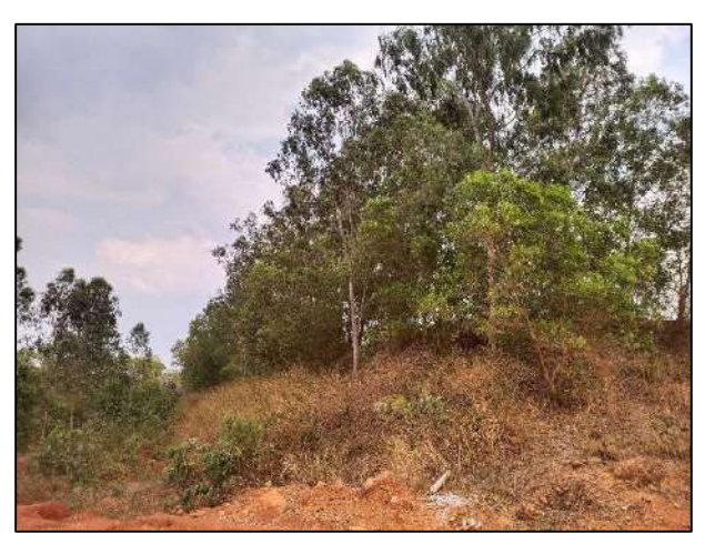
Old Inactive OB Dump with Plantation

Condition-7: Garland drains shall be constructed to arrest silt and sediment flows from soil and mineral dump. The water so collected shall be utilized for watering the mine area, roads, greens belt development etc. The drains shall be regularly desilted particularly after monsoon and maintained properly. Garland drain (size, gradient and length) shall be constructed for both mine pit and for waste dump and sump capacity shall be designed keeping 50% safety margin over and above peak sudden rainfall (based on 50 years data) and maximum discharge in the area adjoining the mine site. Sump capacity shall also provide adequate retention period to allow proper settling of silt material. Sedimentation pits shall be constructed at the corners of the garlands drains and desilted at regular intervals.