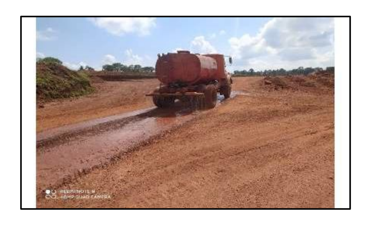
(Pic: Water sprinkling on mines haul road)