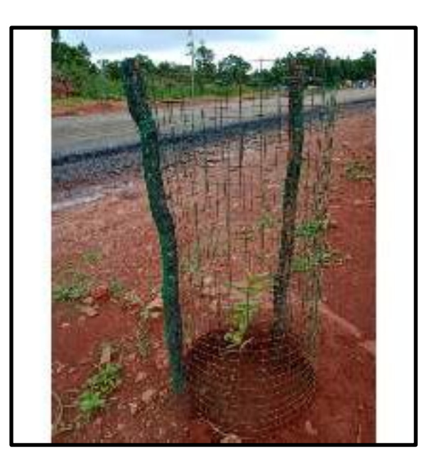
(Pic: Plantation over the Green belt development zone)