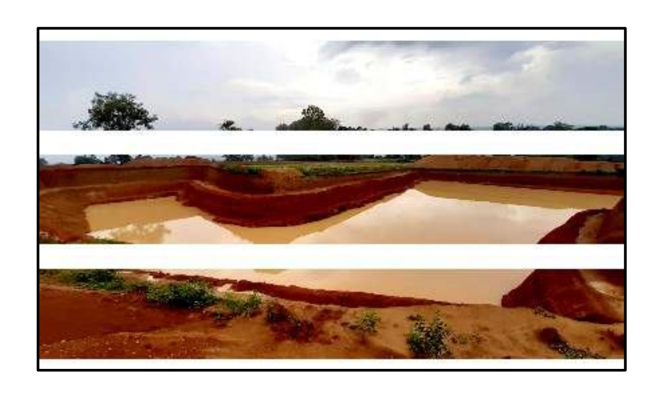
(Pic: Rain harvesting pond developed after mining for the purpose of fisheries, water sprinkling & villagers use)