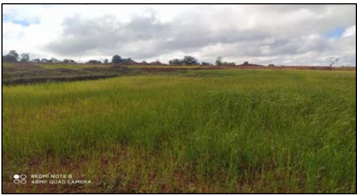
Potato & paddy cultivation over reclaimed area.