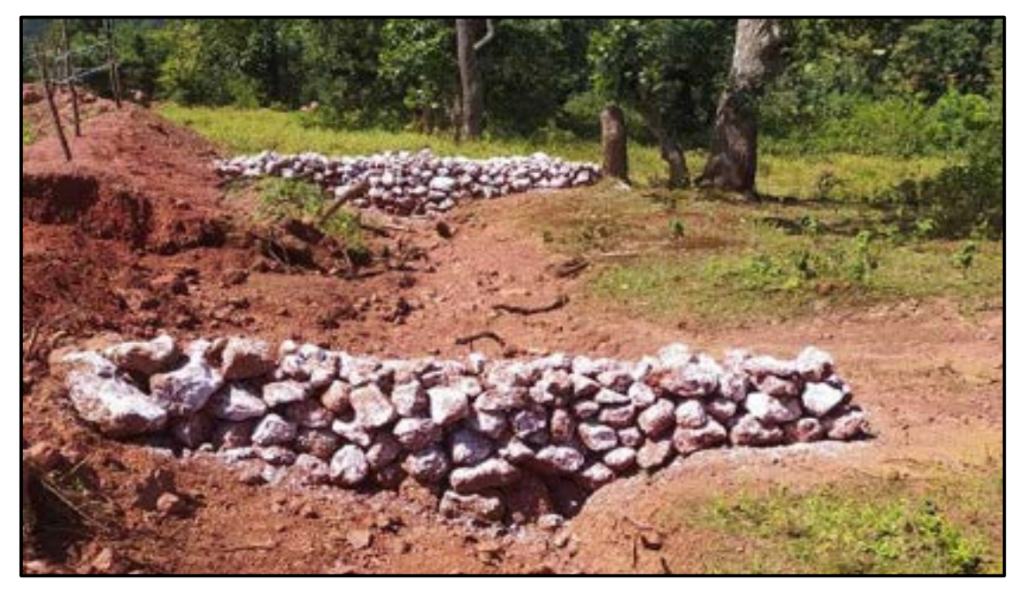
Retaining wall to prevent solid wash-off