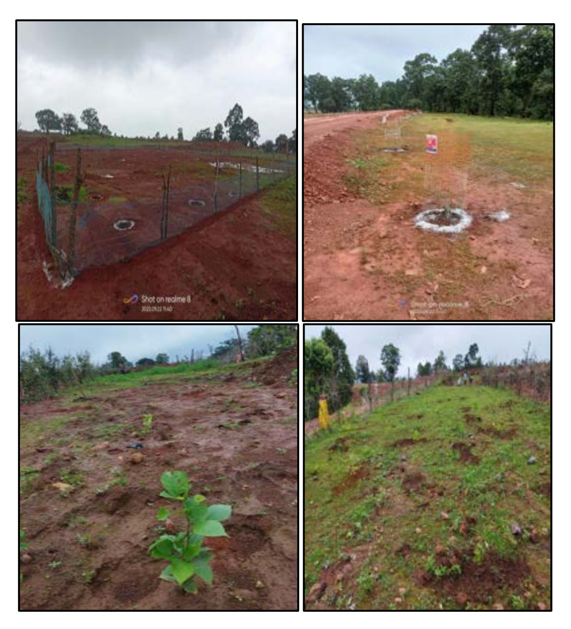
Pic: Greenbelt and roadside avenue plantation