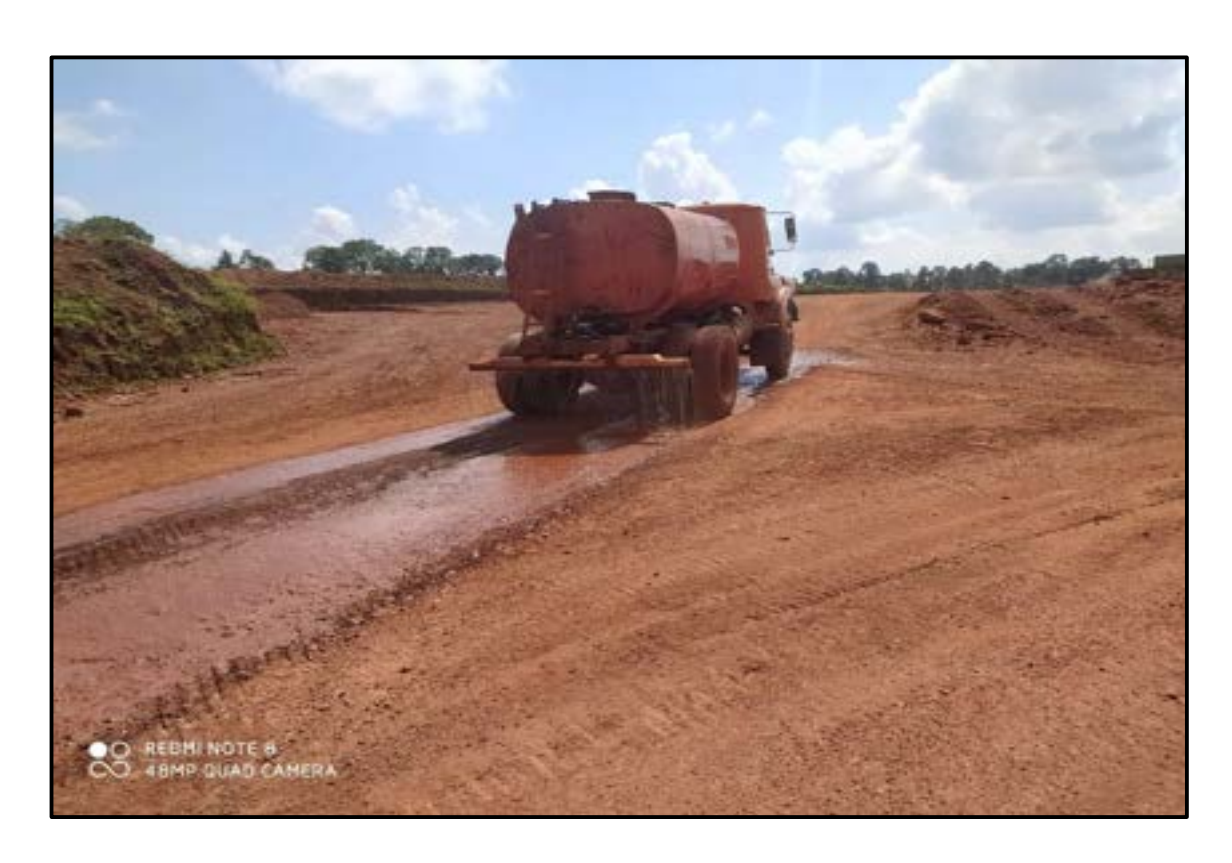
Pic: Water sprinkling on mines haul road.