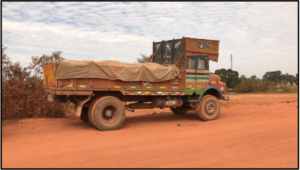
(Photograph of covered truck)