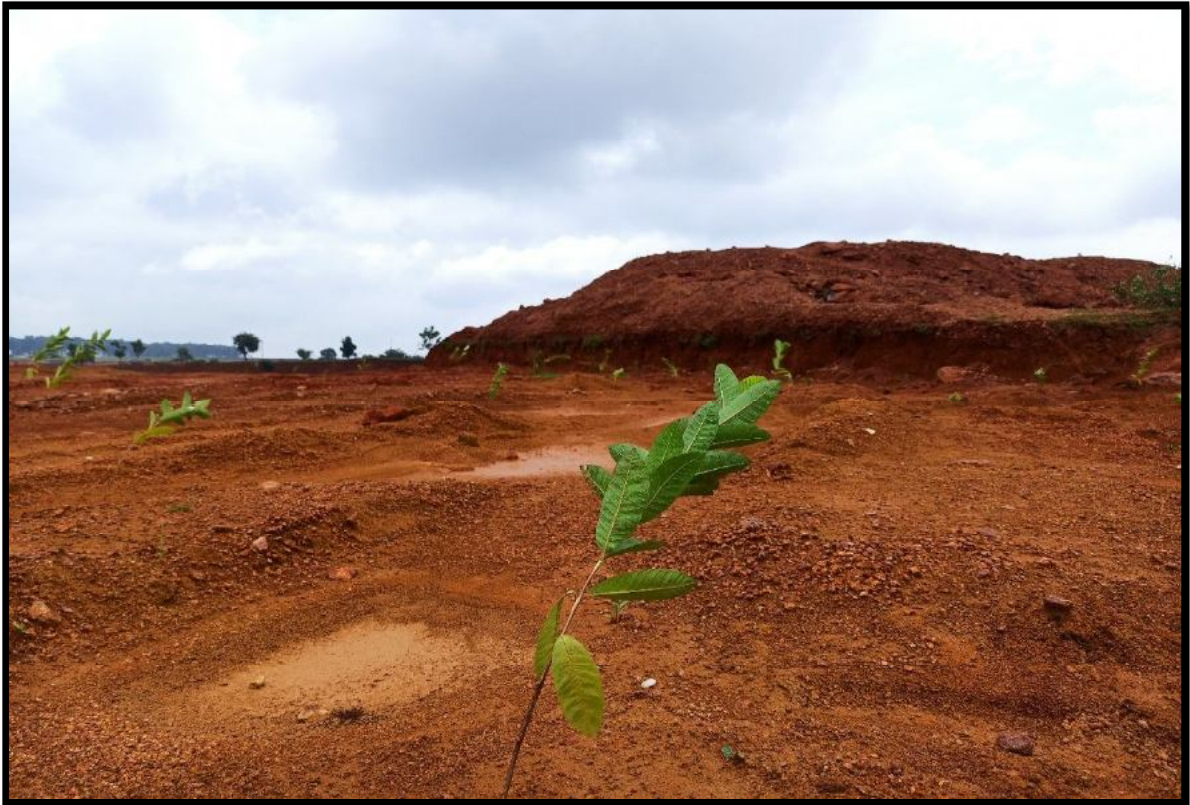
(Photographs of plantation in reclaimed areas)