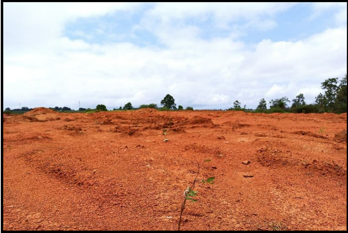
(Reclaimed area for plantation purpose)