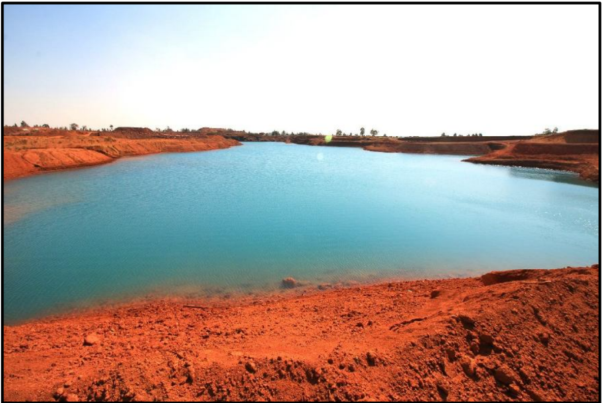
(Photograph of water harvesting pond)