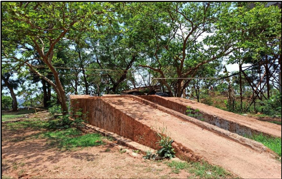
(Photograph of Oil and Grease Trap)