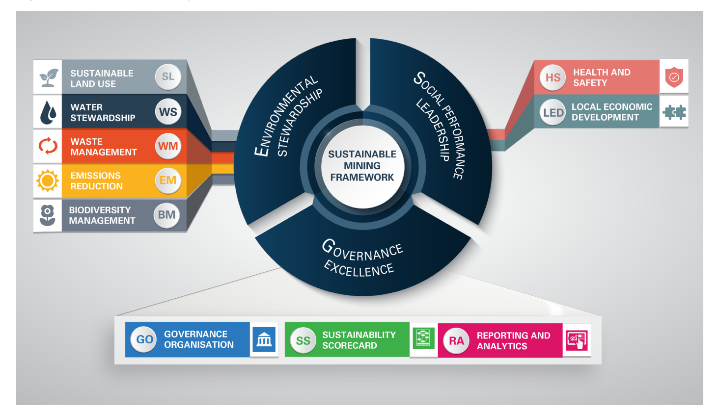
Figure 1. Sustainable Mining Framework

mitigating and offsetting environment impact of mining operations and Social Performance Leadership , focusing on enhancing resilience of communities we operate within. Coupled with a strong governance mechanism , which provides guidance on designing, executing and monitoring sustainability interventions, and reporting sustainability performance, our framework provides a holistic approach for achieving sustainability across the mining operations.