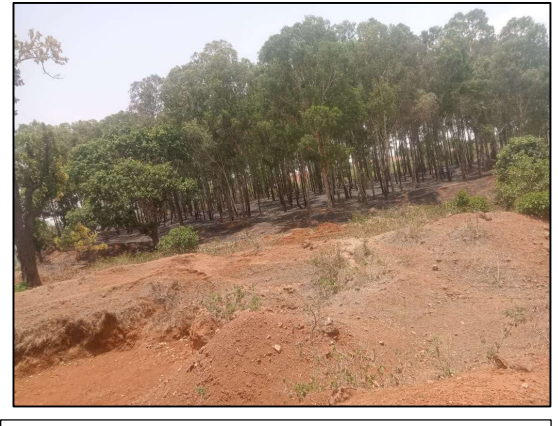
Old Inactive Dump Plantation

Reply to Condition 6: As such there is no any active OB dump at present. As per approved Mining Plan, OB generated during mine operation is being utilized for concurrently back filling of the mined out area for reclamation purpose. Small old inactive OB dump has been stabilized by vegetation with suitable native species to prevent erosion and surface run off.