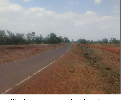
Black top access road to the mines

Condition-7: Measures shall be taken for control of noise levels below 85dBA in the work environment. Workers engaged in operations of HEMM, etc. shall be provided with ear plugs / muffs.