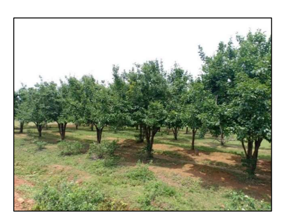
Plantation for Noise Acoustic barrier

Condition-8: Industrial waste water (workshop and waste water from the mine) should be properly collected, treated so as to conform to the standards prescribed under GSR 422 (E) dated 19<sup>th</sup> May, 1993 and 31<sup>st</sup> December, 1993 or as amended from time to time. Oil and grease trap shall be installed before discharge of workshop effluents.