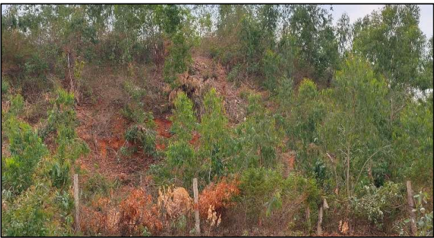
Plantation in Old OB Dump