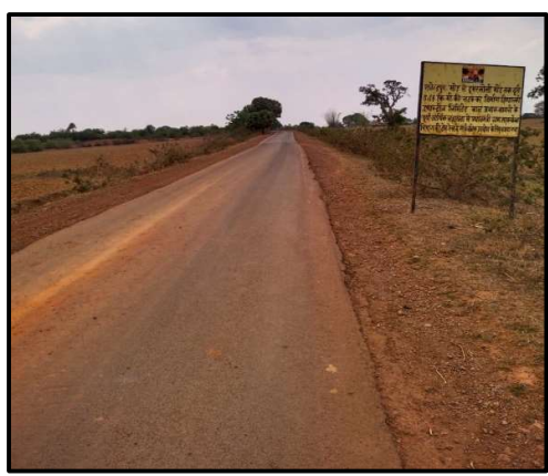
Black top Road to the mines