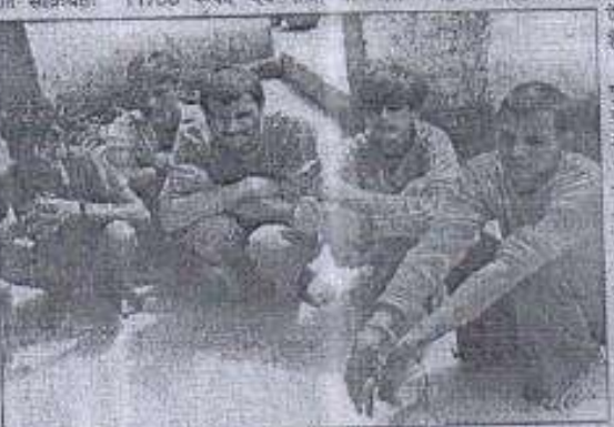
पेसे खोग भी चीलते हैं जुआ

त्र स् तादक, ভাষাত্বাত, কিমাৰ दादव को रंगे डावें प्रकार उनके। कान्ये में संरक्षण 250 कर्पण एक ताश के प्रते जन्म क्रिए गर्हे। सभी जुआहियों पर पृष्टिस में 13 जुआ एस का आतार का है।