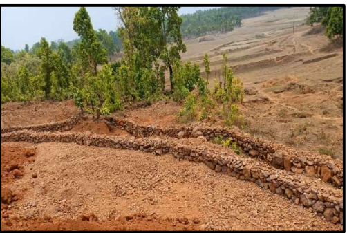
Photographs of garland drains and parapet wall

Condition-8: Slope of the mining bench and ultimate pit limit shall be as per the mining scheme approved by Indian Bureau of Mines.