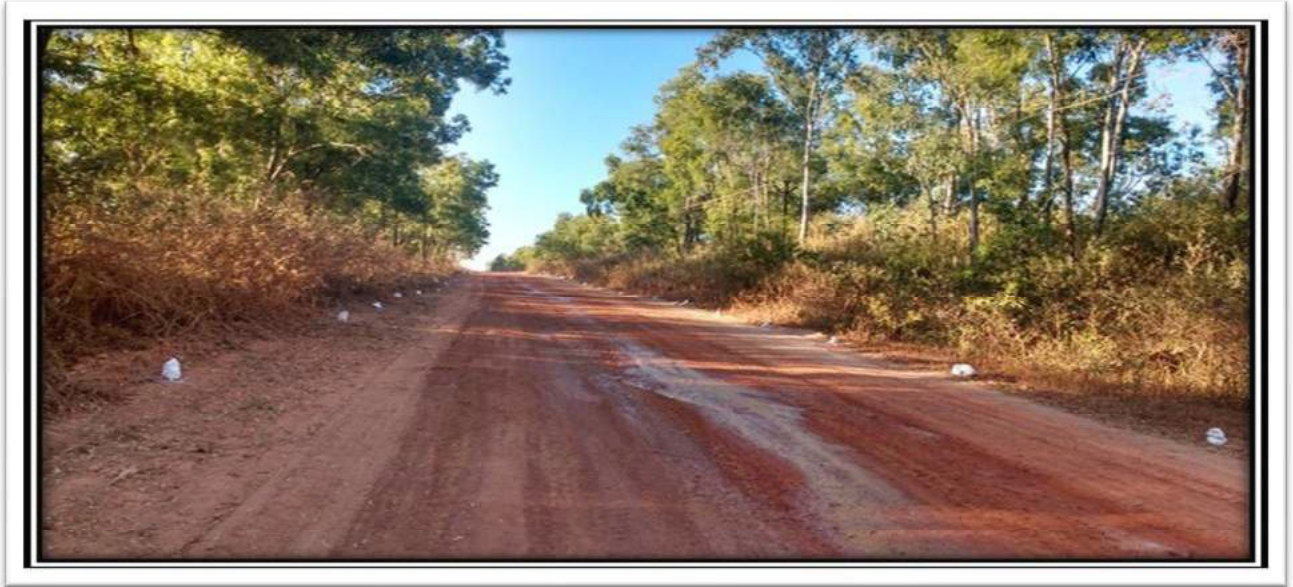
(Green Belt Development along Road side)