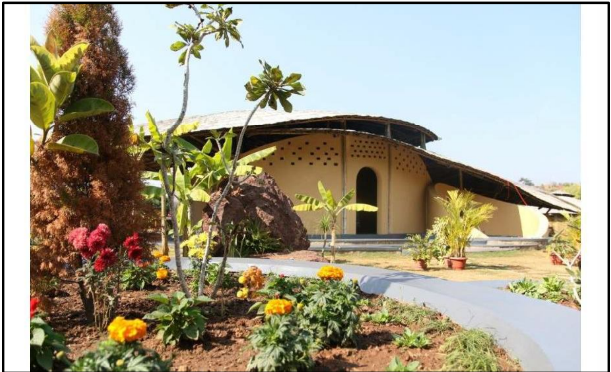
(Biodiversity park at Bagru mine in reclaimed area)