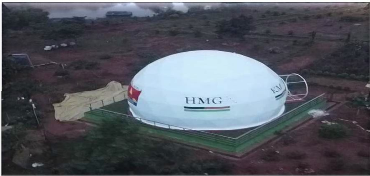
(Biodiversity park and Dome Theatre in Bagru mine in reclaimed area)