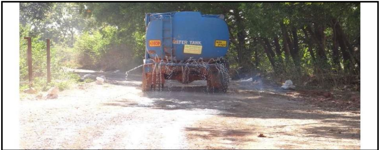
Water Sprinkling at Bagru Mines