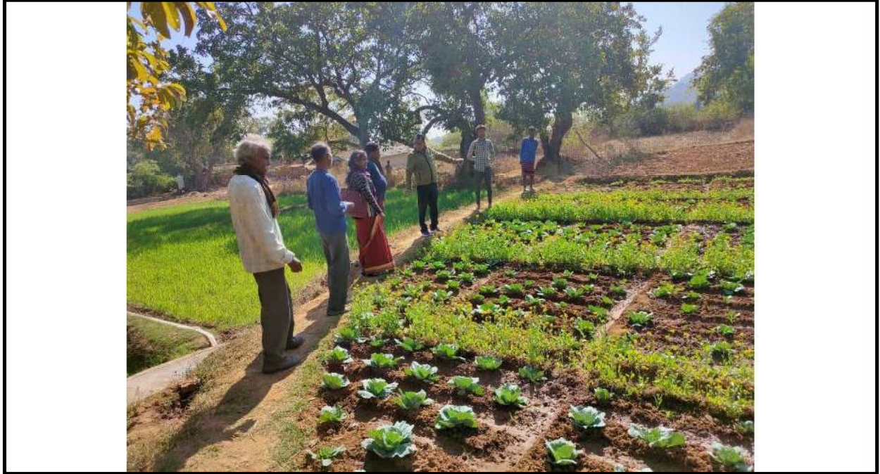
(Cultivation at Bagru mines)