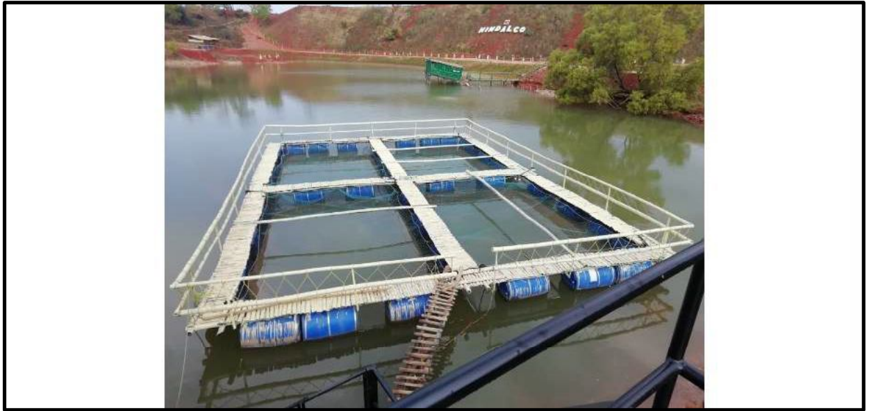
(Rainwater Harvesting pond at Bagru )