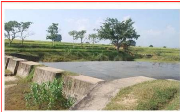
(Water treatment plant)