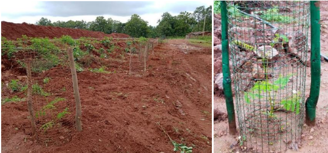
Pic: Road side plantation.