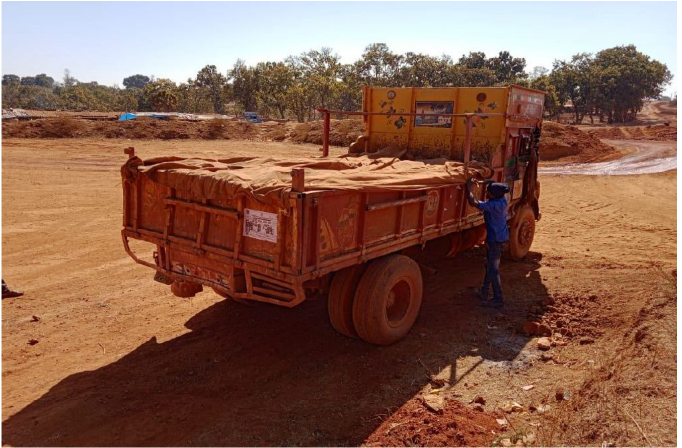
Pic: Trucks ready for dispatch with proper tarpaulin cover