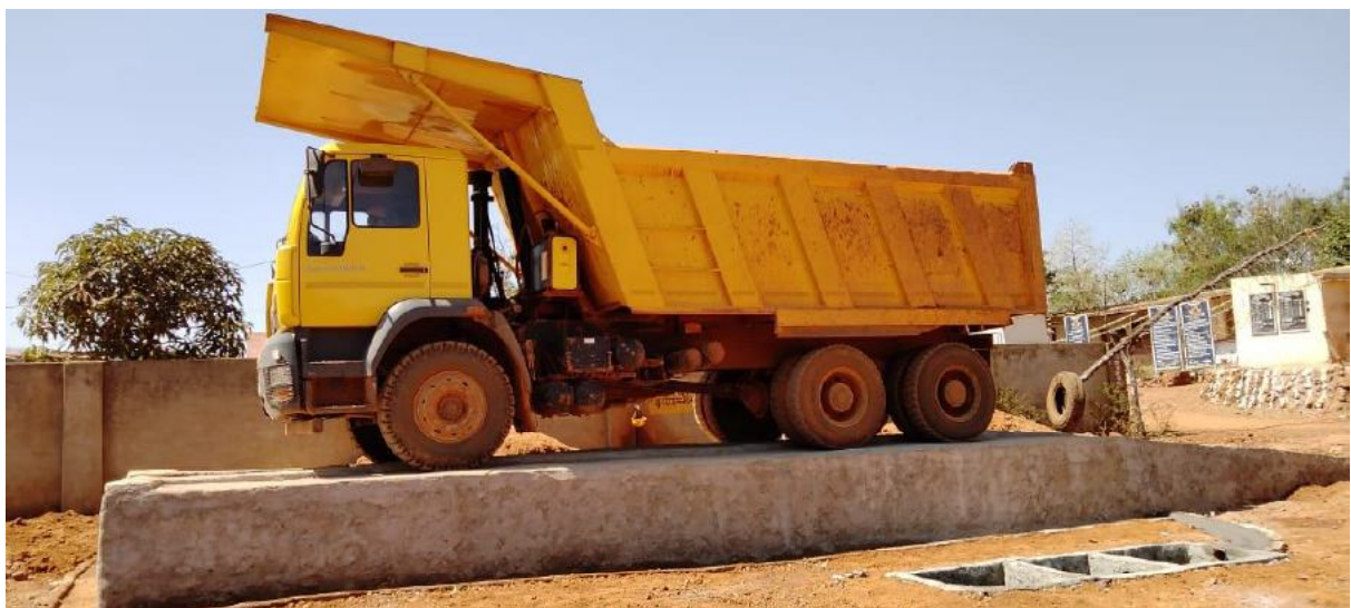
Pic: Washing platform and oil & grease trap.