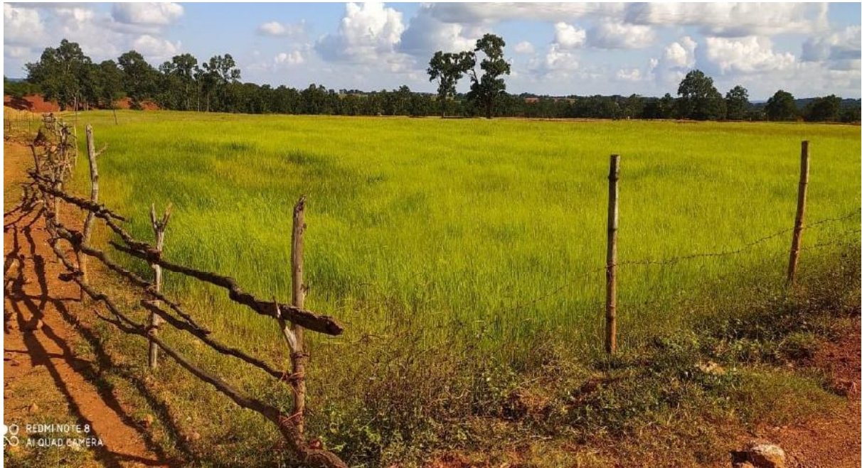
Pic: Paddy cultivation over reclaimed area.