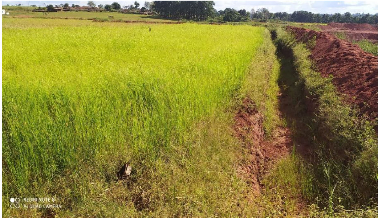
Pic: Paddy cultivation over reclaimed area.