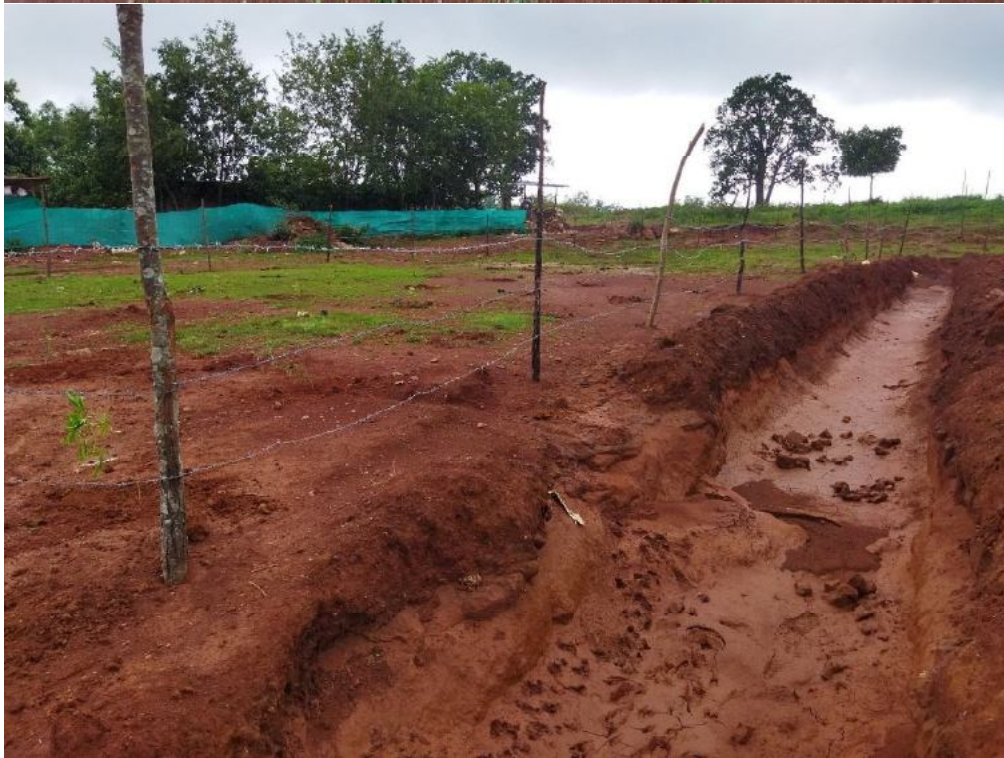
Pic: Safety barrier plantation/ Greenbelt .