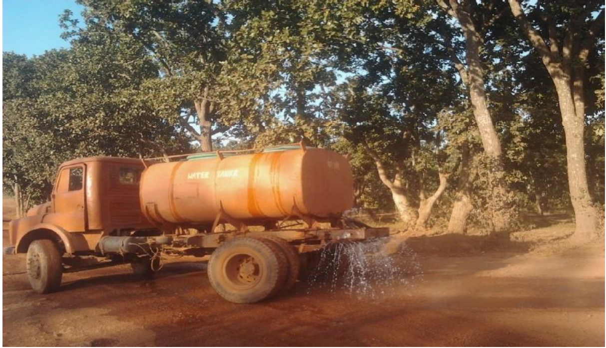
Pic: Water sprinkling on mines haul road.