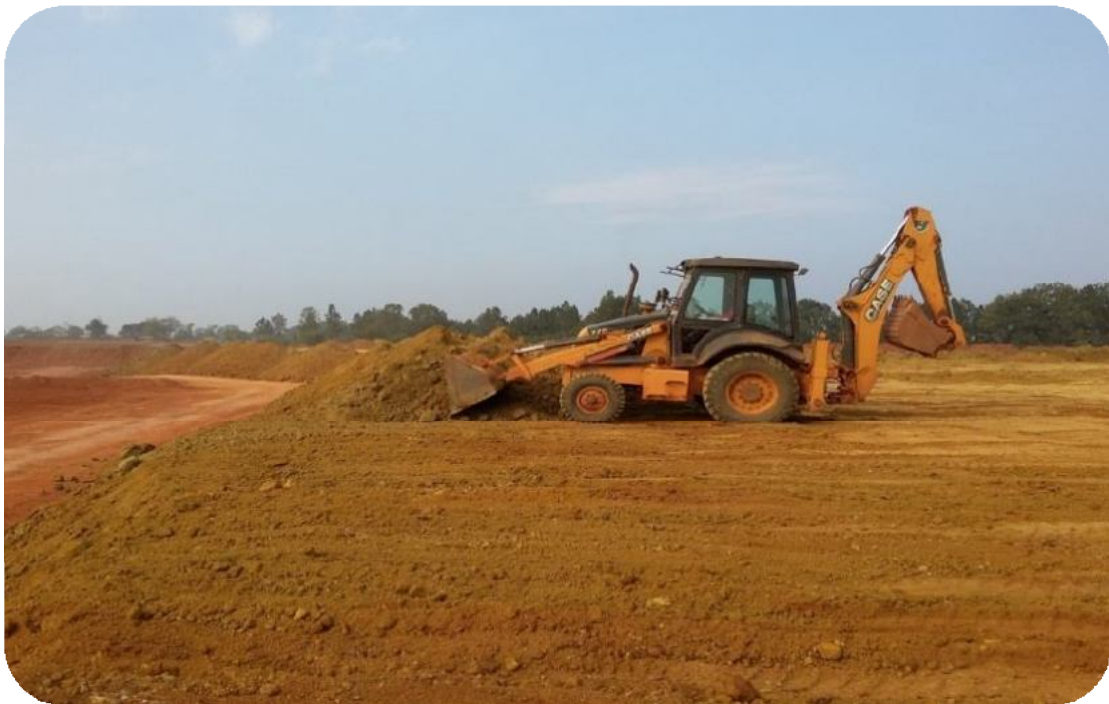
Pic: Reclamation of the mined-out area after mining.