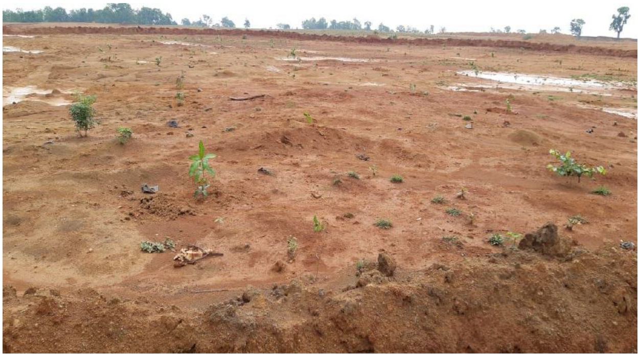
Pic: Plantation over the reclaimed area.